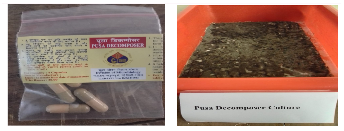
Fig. 1. (a) Pack containing four capsules of Pusa decomposer, (b) Culture prepared from four capsules of Pusa decomposer