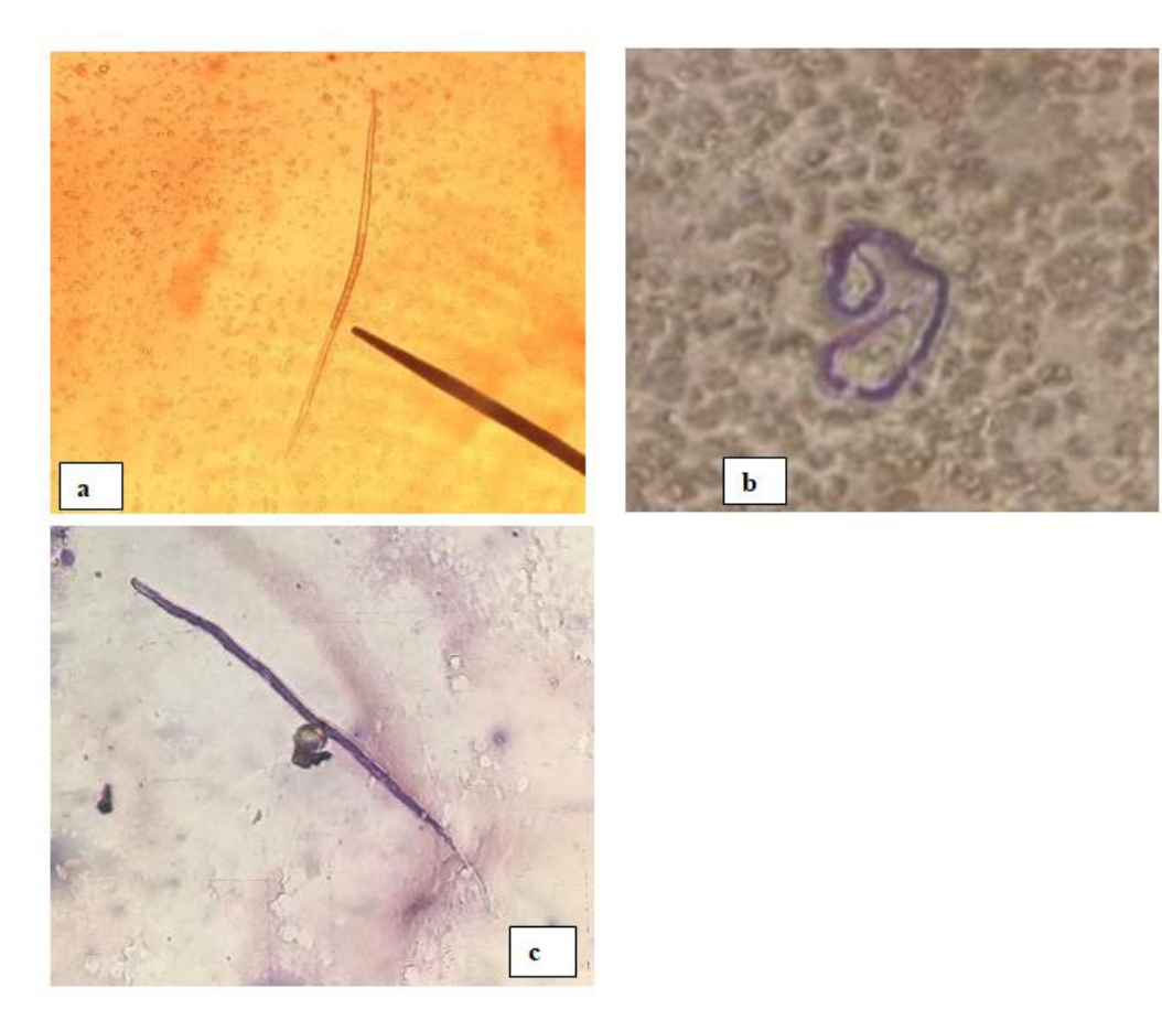
Figure 2. (a) Microfilaria of Dirofilaria immitis , observed in examination of fresh blood, (b) Peripheral blood smear and (c) The modified Knott technique - 40x