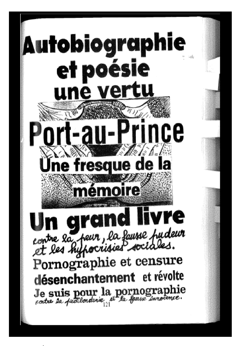
Figure 7: Frankétienne, H'Éros-Chimères Port-au-Prince: Spirale, 2002, pg. 121. With permission of the artist.