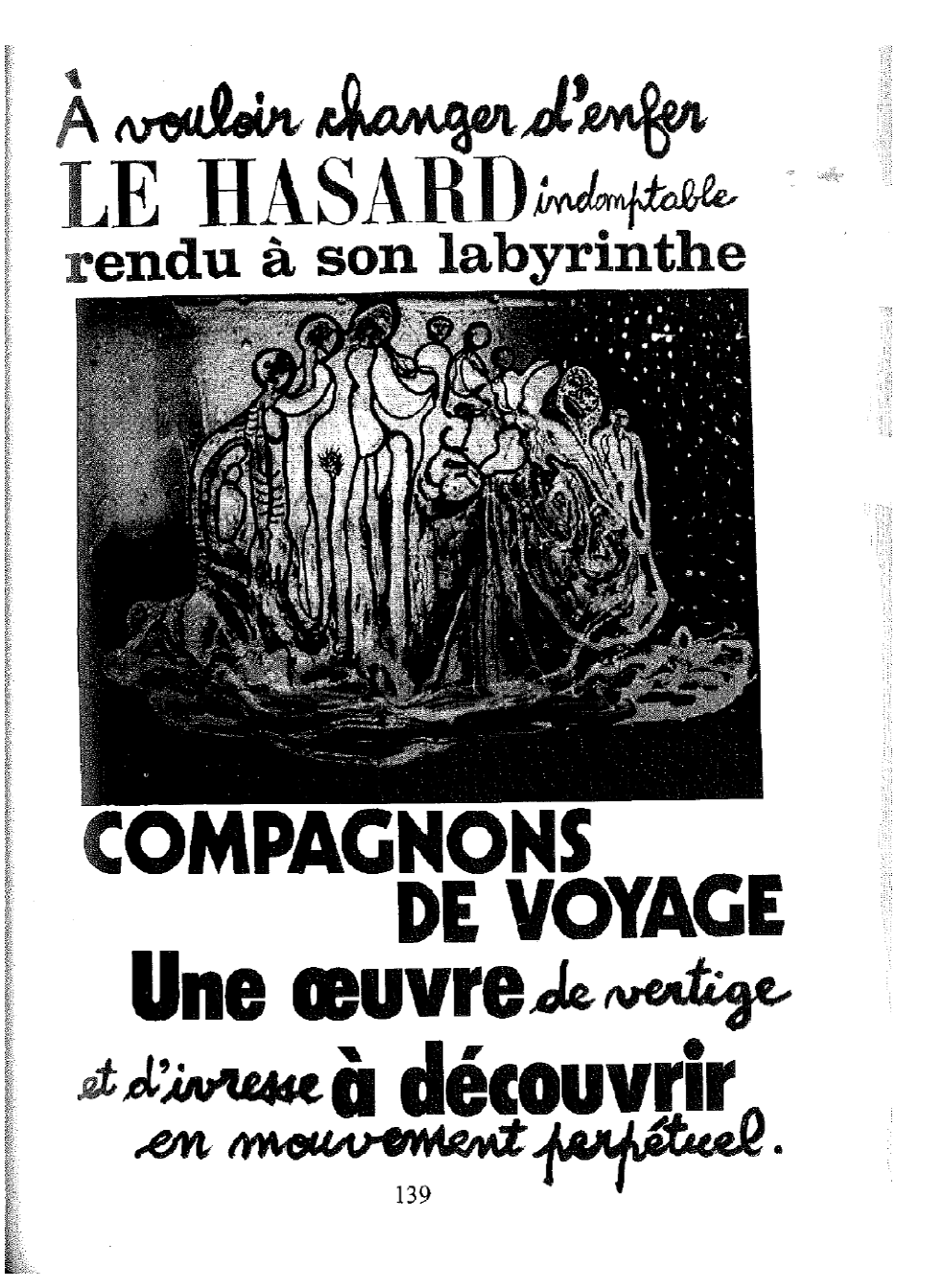
Figure 5 : Frankétienne, H'Éros-Chimères Port-au-Prince: Spirale, 2002, pg. 139. With permission of the artist.