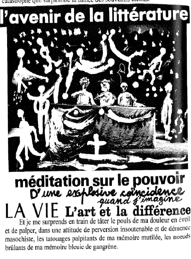
Figure 6 : Frankétienne, H'Éros-Chimères Port-au-Prince: Spirale, 2002, pg. 130. With permission of the artist.

Rayures d'usure au sillage de la mort. Il s'agit d'un temps subjectif illusoire sur un champ de bataille imaginaire au milieu d'un entassement de cadavres mutilés, où l'on perçoit les convulsions des moribonds, les vibrations mécaniques de quelques corps traumatisés par l'ampleur du désastre. La mémoire hachée, émiettée, pulvérisée par l'étendue de la catastrophe que surplombe la fumée des souvenirs éteints.