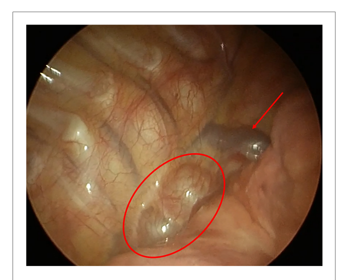
FIGURE 3 Foregut duplication cysts. Intrathoracic picture (arrow: azygos vein; circle: FDCs).