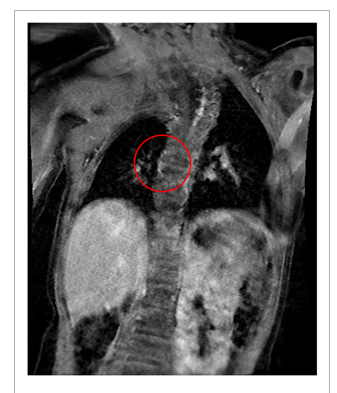
FIGURE 4 MRI scan 16 months after surgery (the circle shows no lesions).

After 12 months of follow-up, the patient showed any GI symptoms, and oral feeding was compliant Sixteen-month MRI showed normal anatomy of the esophagus (Figure 4).