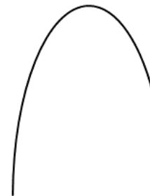
Figure 3 A compound curve (an ‘egg curve’)

A compound curve, often referred to as an ‘egg curve’ in Norwegian, is a curve that does not have constant radius. It, in a sense, resembles the curvature of an egg. Figure 3 is an attempt at drawing such a curve.