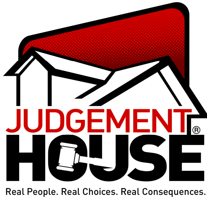
Figure 4.1. The Judgement House logo and slogan

Judgement House does not attempt to represent reality as a twisted and morally remiss playground, but as a legitimate social system through which the Christian must navigate by utilizing their faith and its rewards as a guide. The reality they seek to create is the social structure as participants believe it operates; in Judgement House the contemporary world is not Hell, fever dream, nightmare, etc. (as is posited in Scaremare , Nightmare , and Hell House ). In Judgement House Hell is Hell, Heaven is Heaven and a car crash is a car crash. The narrative metes out a judgment that is systematic and non-confrontational to the established and organized order; this judgment bears relation to the real systems of everyday life. For instance, the script Web of Lies begins with an execution by lethal injection and the story then follows the path of how the executed arrived at the confluent moments of spiritual and social justice. In the Judgment room the audience stands before the heavenly