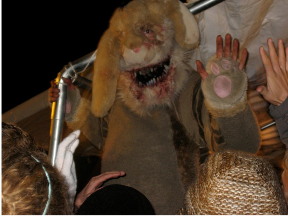
Figure 2.5. Demented bunny waving to the crowd at Scaremare

Clearly, Scaremare and other performances such as Nightmare , Hell and Judgement Houses can be understood as representative of American society and American Christianity's relationship to the consumer culture of horror, violence, and gore in the contemporary world. However, scenes that intersect popular culture, as well as that those hold religious significance or deal with the demonic and occult, especially in Scaremare , because of its ties to Liberty, are carefully debated, vetted, and organized.