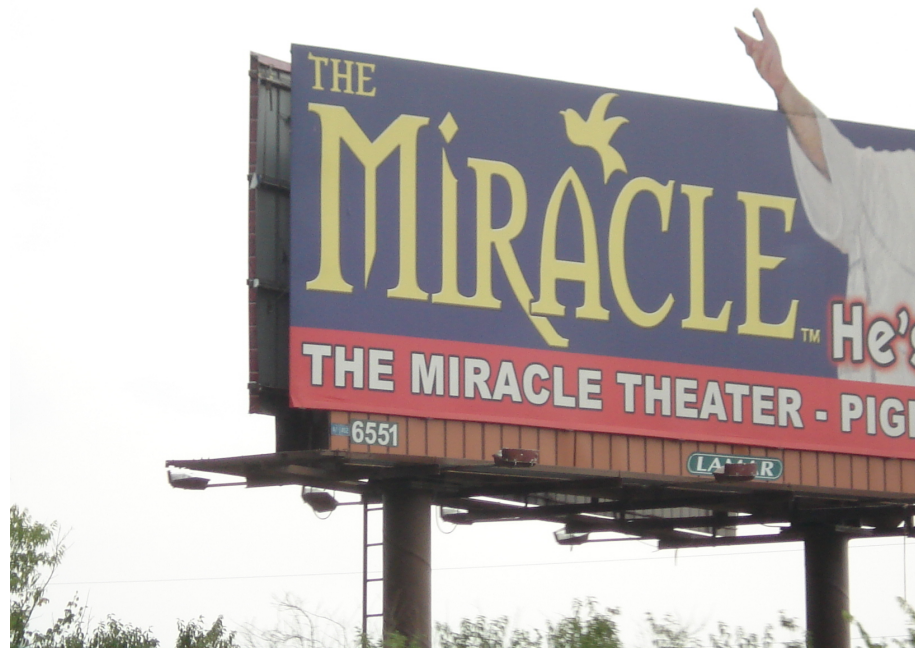
Figure 6.3. Billboard for The Miracle in Pigeon Forge, Tennessee