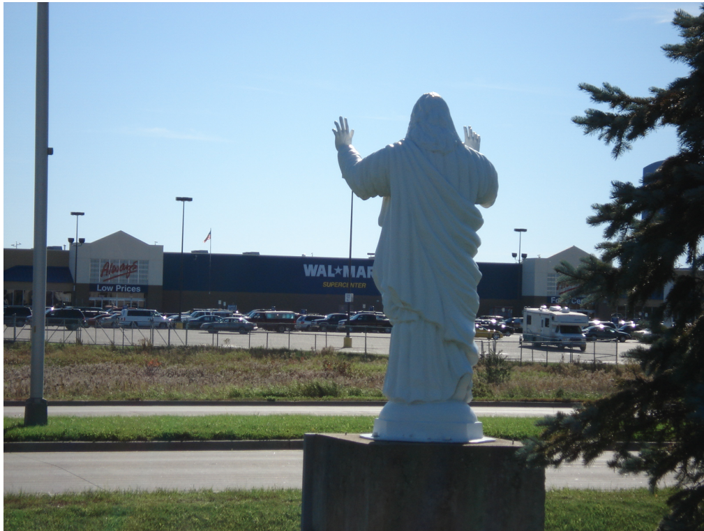
Figure 3.1. Statue of Jesus, “The Listener” in front of Applebee’s in Marshfield