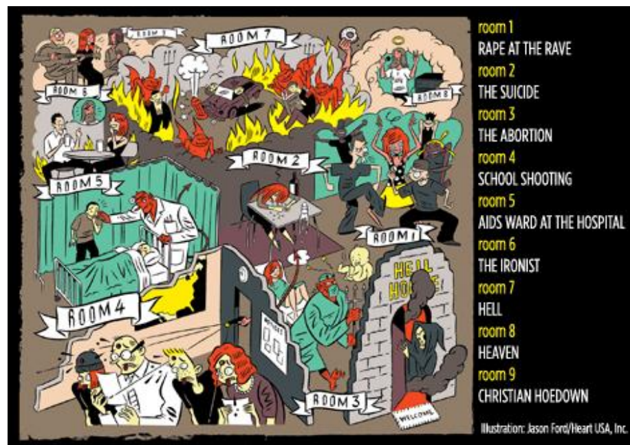
Figure 6.7. Publicity image for Les Frères Corbusiers Hell House