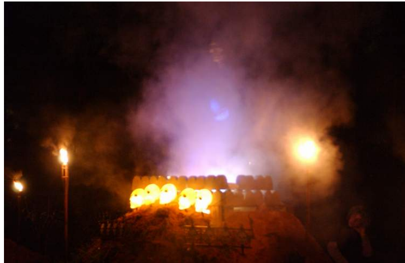
Figure 5.3. Platform for demon introducing the Four Horsemen of the Apocalypse We are herded out of the impromptu theatrical bunker back towards the woods. We enter the wooded area on the opposite side of the field from where we had started. Gunfire is everywhere around us now. It seems almost as if the movie itself has brought on The Rapture through its piling up of frenzied images. As is indicated above, chaos surrounds us; the absence of the Raptured Christians is

Nothing (not even God) now disappears by coming to an end, by dying. Instead, things disappear through proliferation or contamination, by becoming saturated or transparent, because of extenuation or extermination, or as a result of the epidemic of simulation, as a result of their transfer into the secondary existence of simulation. Rather than a mortal code of disappearance, then, a fractal mode of dispersal... 539