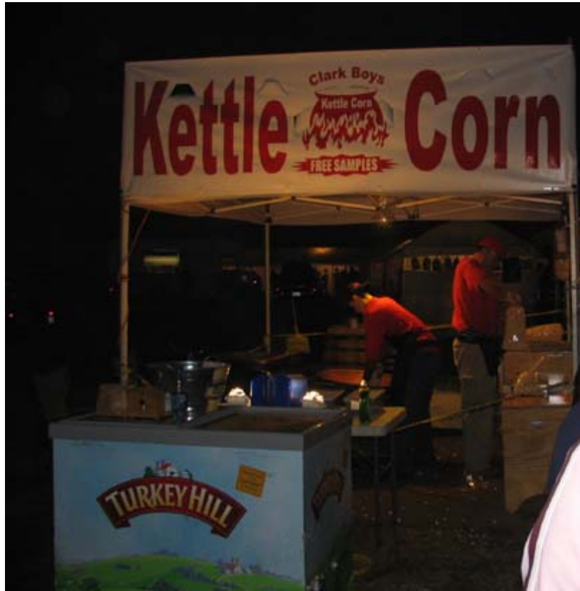
Figure 2.3. Concessions in line at Scaremare

The performance site consists of an abandoned two-story brick high school and its adjacent football fields abutted by an old rail road bridge. Adding to the mythos of the event the old school building is “rumored to have been a day care center, an orphanage and the site of at least one death.” 140