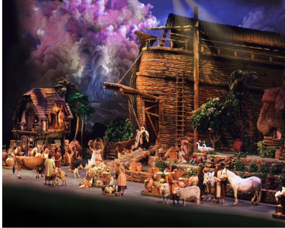
Figure 6.4. Noah: The Musical at the Sight & Sound Theatre in Branson, Missouri

There are also many groups in churches, and independently, who supply Christian scripts to churches and Christian performance groups, as well as groups who tour nationally and internationally. Within the huge array of church drama groups, signing, role play, and expressive dance are also quite popular.