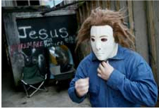
Figure 2.2. A Liberty University dresses as Michael Myers, a character from the Halloween movie series

Scaremare , or The House of Death, is Falwell's Liberty University's religiously oriented response to Halloween, began in 1972. Formed from the basic skeleton of a haunted house, Scaremare is a precursor to Hell House, Judgement House, and Nightmare . The event is a non-franchise based performance that is highly gruesome and quite entertaining. 139 Scaremare takes an approach somewhat devoid (until the end) of the obvious and overt morally charged message of many of the other performances in this vein. It is horrific, gruesome, grizzly, and gross.