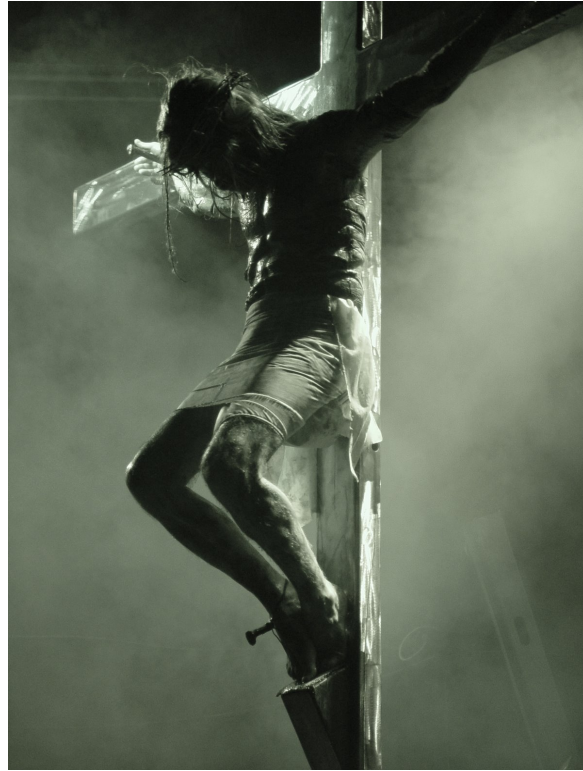
Figure 2.12. Christ on the cross

GUTS brings together currents of ministry common to many types of community-based Christian performances that center on the afterlife and the demonic and operate out of a desire to bring teens in on their own terms. Often performances focus on: blood, guts, and terror.