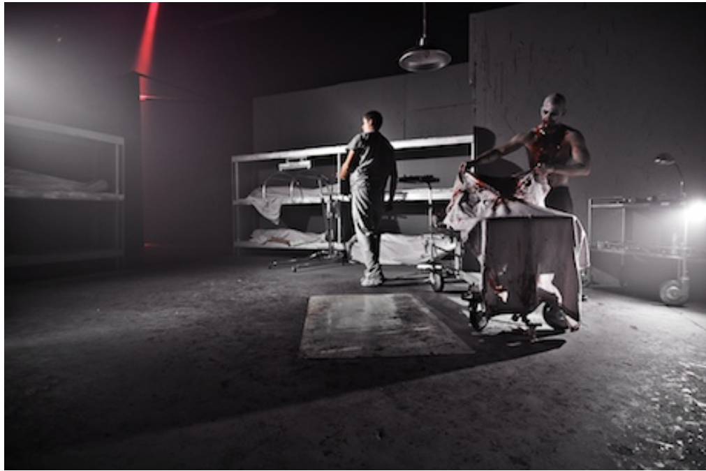
Figure 2.10. Demon putting away body after abortion scene