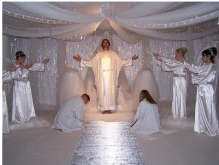
Figure 4.2. Judgement House Heaven scene

The audience members proceed through a series of rooms set up all over the church grounds, in and out of Sunday school classrooms, gymnasiums, cafeterias, libraries and sanctuaries, parking lots, and roads. The trail is draped and labyrinthine, transforming straight forward hallways into a network of break rooms, prayer rooms, and performance spaces. After proceeding through the earthly storyline, which ends in some form of calamity, the groups faces Judgement where each audience member’s name is called, along with the characters. The audience then travels to Hell and Heaven (most often performed in the church sanctuary) and finally to a room of prayer where the significance of the event is explained one last time.