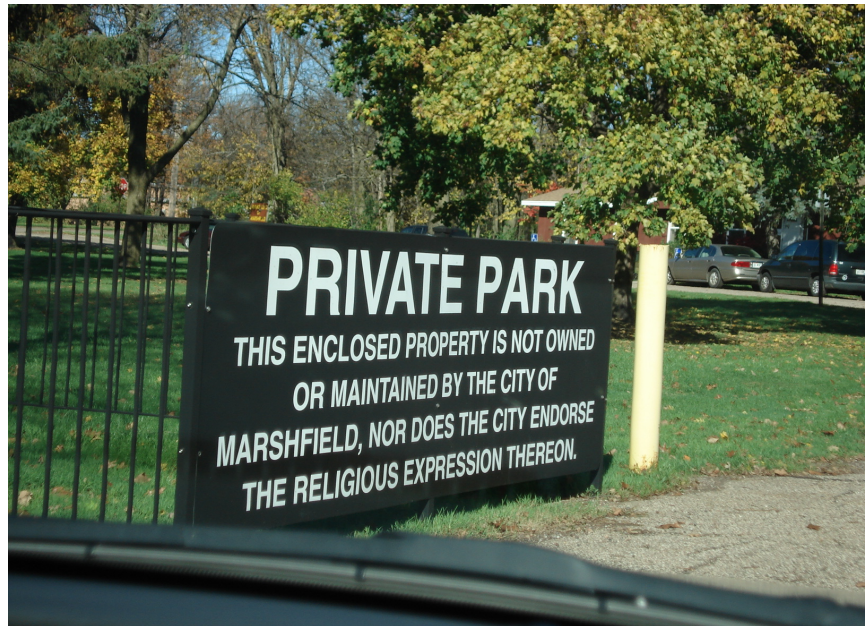
Figure 3.2. Sign demarcating the statue of Jesus from Marshfield City property

From the road, and with no context, it seemed an odd sign. The statue housed within the gates was hardly visible to passing motorists; what was quite apparent was the sign itself; there was no missing that. As Freedom from Religion Foundation lifetime member Clarence Reinders expresses it: