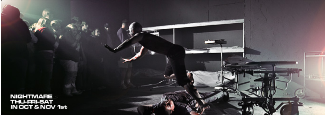
Figure 2.9. Demon lunges at audience members after death scene

I guess you could call it a Christian “spook house,” but it is so much more. For all of us long-time Tulsa residents, we eagerly look forward to this major community event. In 2006 over 30,000 people attended the Nightmare , making it one of the largest special events in Oklahoma. 197