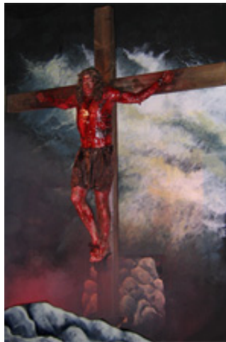
Figure 3.3. Christ after being crucified in Marshfield's Nightmare 2003

Significantly, throughout the whole performance the three rooms of the crucifixion are the smallest, simplest, and most intimate; the audience stands closest to the performers in these scenes, the body of Christ and its torment take precedence. There are no car wrecks, living rooms or gun shots, just audience, the body and its torturers, a transcendent suffering.