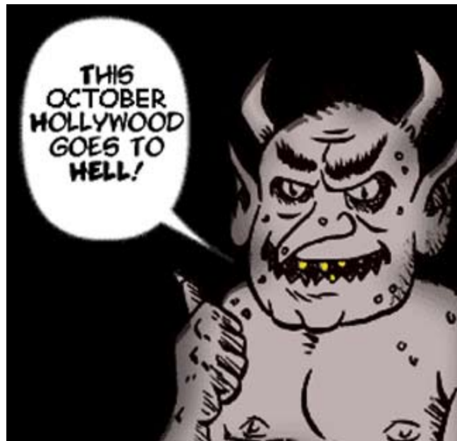
Figure 6.6. Publicity image for Hollywood Hell House