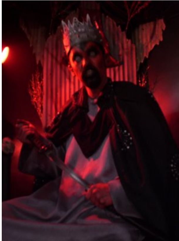
Figure 2.7. Satan on his throne

In almost every community I researched and/or observed I heard about the audience member who broke down while witnessing a particular scene. In one Judgement House in Roanoke I watched a teenage boy punch through a wall in the hallway after leaving the Hell scene. 181 One of the great strengths of these performances is that they understand and appreciate the participant–audience relationship and use the feedback from actor to audience to make the performance more effective. Within the slippery frames of these performances, church members and participants alike negotiate with, comment on, and play within the balance of power (real and imaginary).