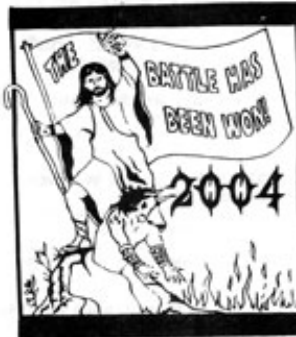
Figure 5.1. Tribulation Trail logo 2004