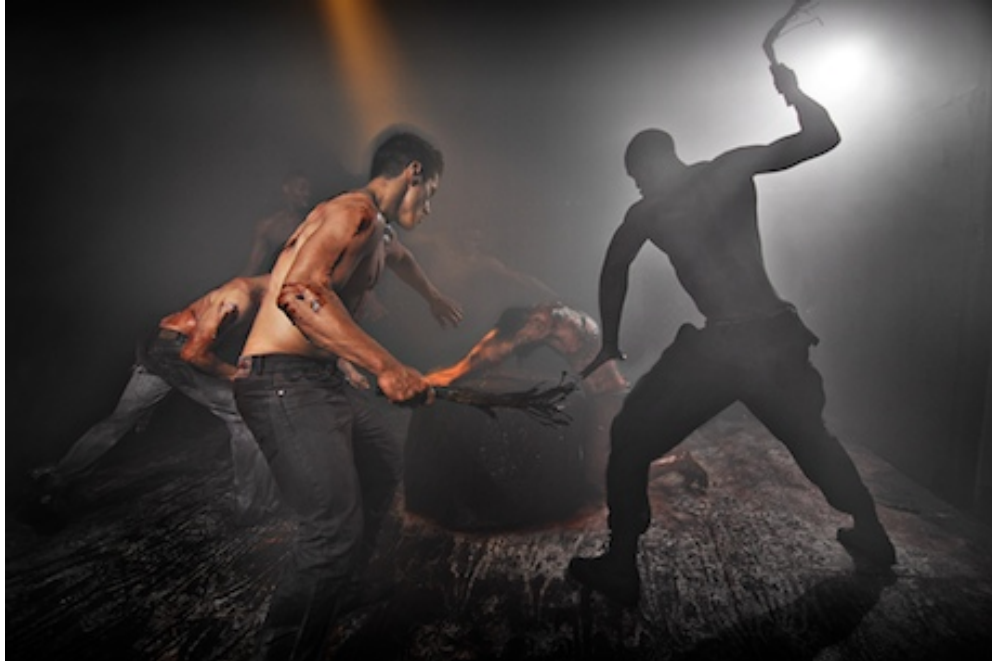
Figure 2.11. Christ being beaten before being crucified