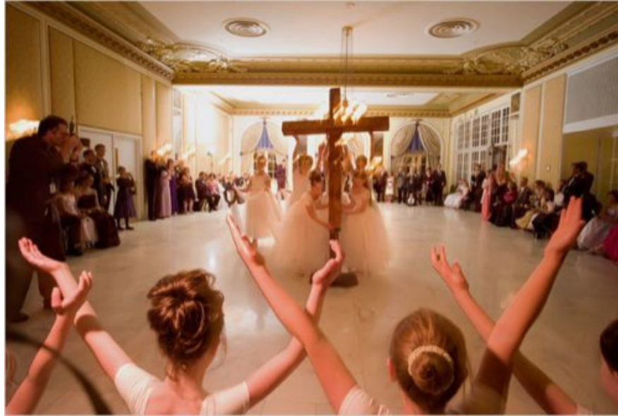
Figure 6.5. Celebratory ballet at Father and Daughter Purity Ball

Studies of each of these types of performances would allow for the examination of how Christian culture positions itself in relation to mainstream culture and would foster better understandings of the relationships between the two realms.