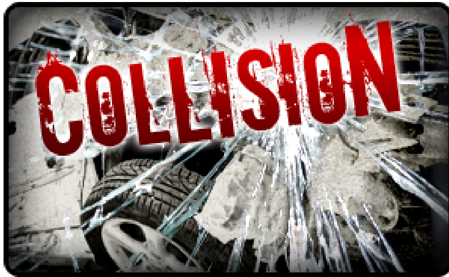
Figure 4.3. Promotional image for Collision script