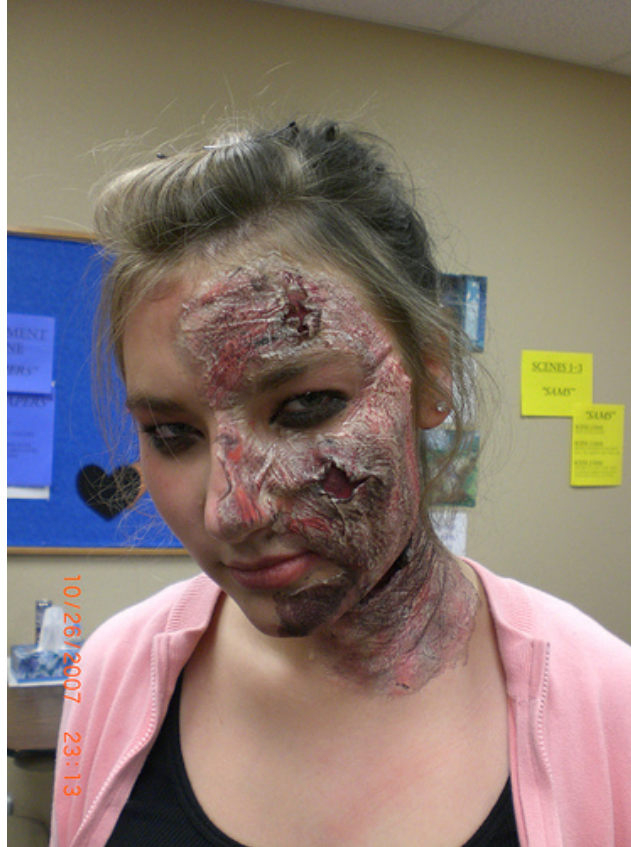
Figure 2.6. Image of performer made up to appear half-demonic

An indication of the carefully balanced relationship between performance identity and the performer's real social identity is evident in the process of the physical preparation for one's role. The make-up choices themselves are created by church volunteers who research online and within contemporary culture to learn how to enact the symbolic transformation of the demons and the damned from their previous identity as committed congregants into their new temporary identity as the unholy.