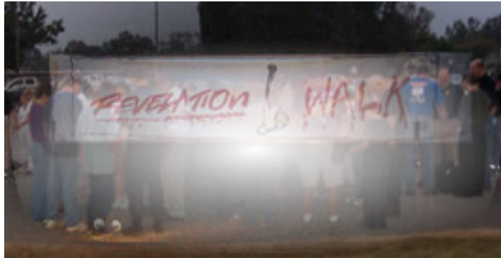
Figure 5.4. Revelation Walk publicity image

Our Mission is to be a Family of Faith. We have been called into a living, growing relationship with God through His Son. We will share the good news by word and deed. To be a People of Compassion , we know God’s unlimited and unconditional love. We will be instruments of His love to those who are hurting, lonely, and discouraged. To be a Community of Service , we have received God’s best, His only Son. We will give our best service to God through the use of the gifts He has placed in us. To be a Body of Worship , we have experienced the glory of our sovereign God. We will glorify God through corporate and individual worship, seeking to magnify Him in all that we do.