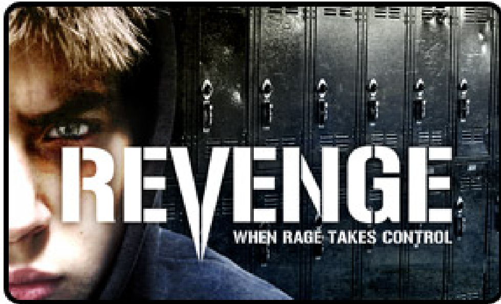
Figure 2.1. Promotional image for Revenge script

“Revenge!” is a story we see all too often on the evening news. A young, man tired of being pushed around at school, takes matters into his own hands with deadly consequences. Simon feels like a geek and an outcast at school and even at home. His father doubts he will ever amount to anything and has no problem telling him so. Mitch and his football teammates enjoy humiliating and bullying Simon any time they can. Toby is a Christian and tries to reach Simon and the other students at school with the message of a saving and personal relationship with Jesus Christ, but Simon can’t believe that anyone could ever love him, and chooses not to accept God’s offer of salvation through His Son Jesus Christ. Mitch and his friends cross a terrible line when they steal Simon’s treasured journal and pass its contents throughout the school lunchroom. All the pain, hurt and embarrassment boil over in Simon’s mind and rage takes control and revenge is the only thing he wants, and unfortunately for the students at his school, he gets it. 107