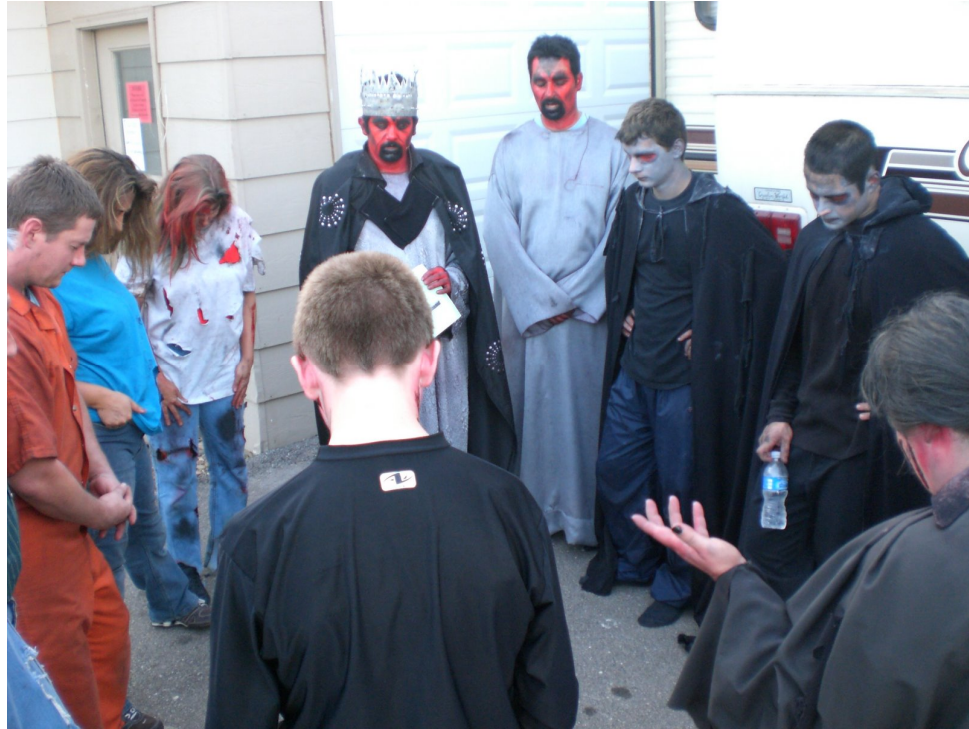
Figure 2.8. Cast for the Hell scene praying together before the performance begins

Because it uses bold designs and rampant sensationalism, as well as the promise of salvation, word spreads quickly among community members. Local and national media coverage, of Hell Houses especially, contributes to their notoriety. To entice more press, Reverend Keenan Roberts has a library of bombastic, in your face, rhetorical slogans to attract the media and protestors such as: “Shake your city with the most in-your-face highflyin’ no denyin’ Satan be cryin’keep you from fryin’ theatrical stylin’, no holds barred cutting edge evangelism tool of the new millennium!” or “Get prayed up and powered up and be prepared for the ride of your ministry life!” 189 After all, good protest means good money.