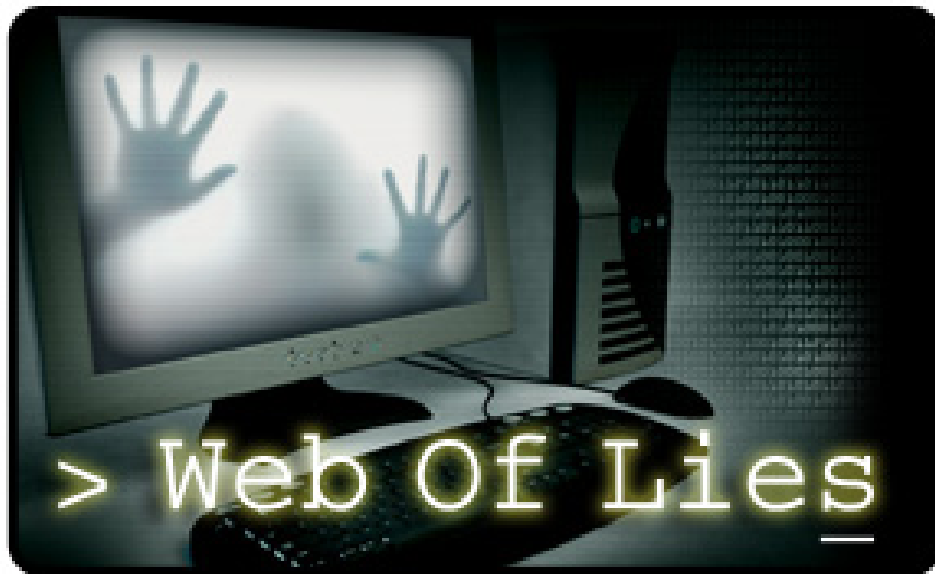
Figure 4.4. Promotional image for Web of Lies script

church members helping with JH. To put that into perspective, our average weekly worship attendance is 700. 470