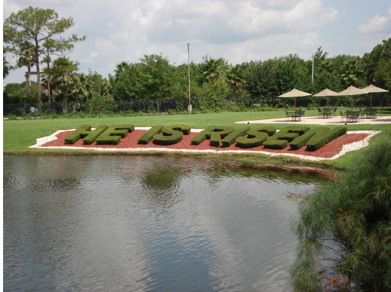
Figure 6.2. Lake and gardens at The Holy Land Experience