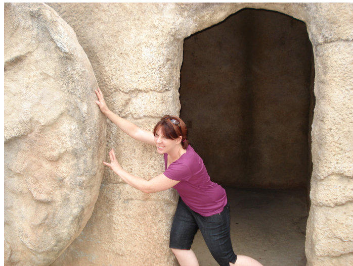
Figure 6.1. Opening the Christ’s Tomb at The Holy Land Experience

would serve as wonderful contributions to our understandings of how performance articulates political, religious, and social concerns. They would also work to point out viable entrance points into understandings of the relationships between the Christian “parallel” consumer market and the mainstream market. Though many are decidedly not community-based performances such as those at the Sight & Sound Theatre (a large scale Christian performance venue in Branson, Missouri and Strasburg, Pennsylvania), The Miracle , an extravaganza about the life of Christ outside of Dollywood in Pigeon Forge, Tennessee, and The Holy Land Experience theme park in the shadow of Disney in Orlando, Florida, they do afford a broad range of inquiries into the relationship between belief, consumption, American identity, and the social world.