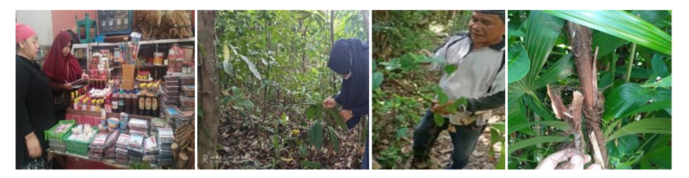
Figure 2. Samples of identification traditional medicine of Dayak Bakumpai and Dayak Ngaju Tribes, Central Kalimantan, Indonesia