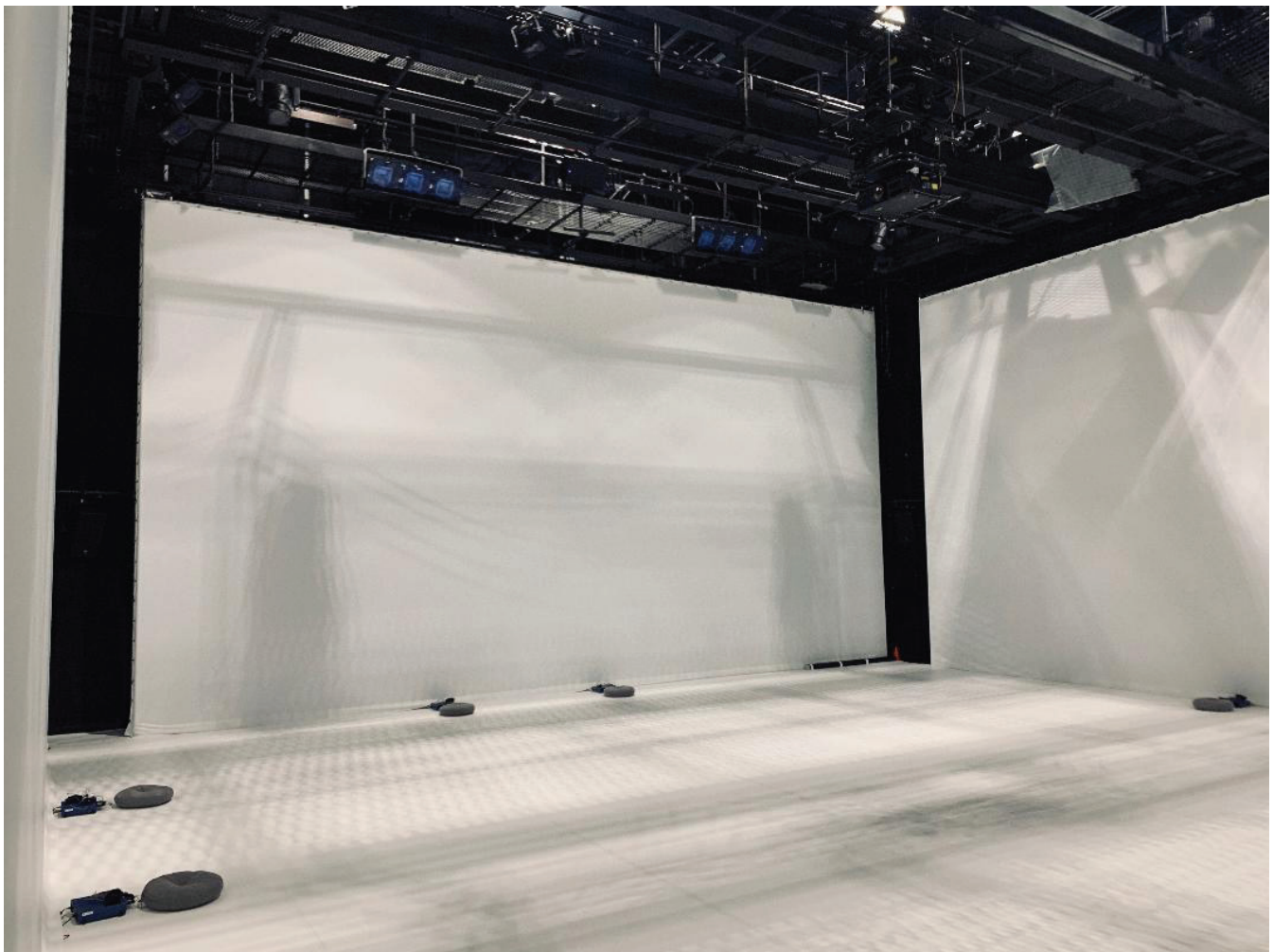
Figure 3. Photo of the immersive theatre with 10 seat cushions, equipped with Biopac sensors for the spectators

Descriptive statistics were calculated for the quantitative instruments used, and then correlational analyses were conducted among the AWE-S, STAI, and PANAS. A repeated measure one-way ANOVA was assessed the impact of the dance performance on STAI scores. As mentioned above, we used IPA (Smith et al., 2009) to explore