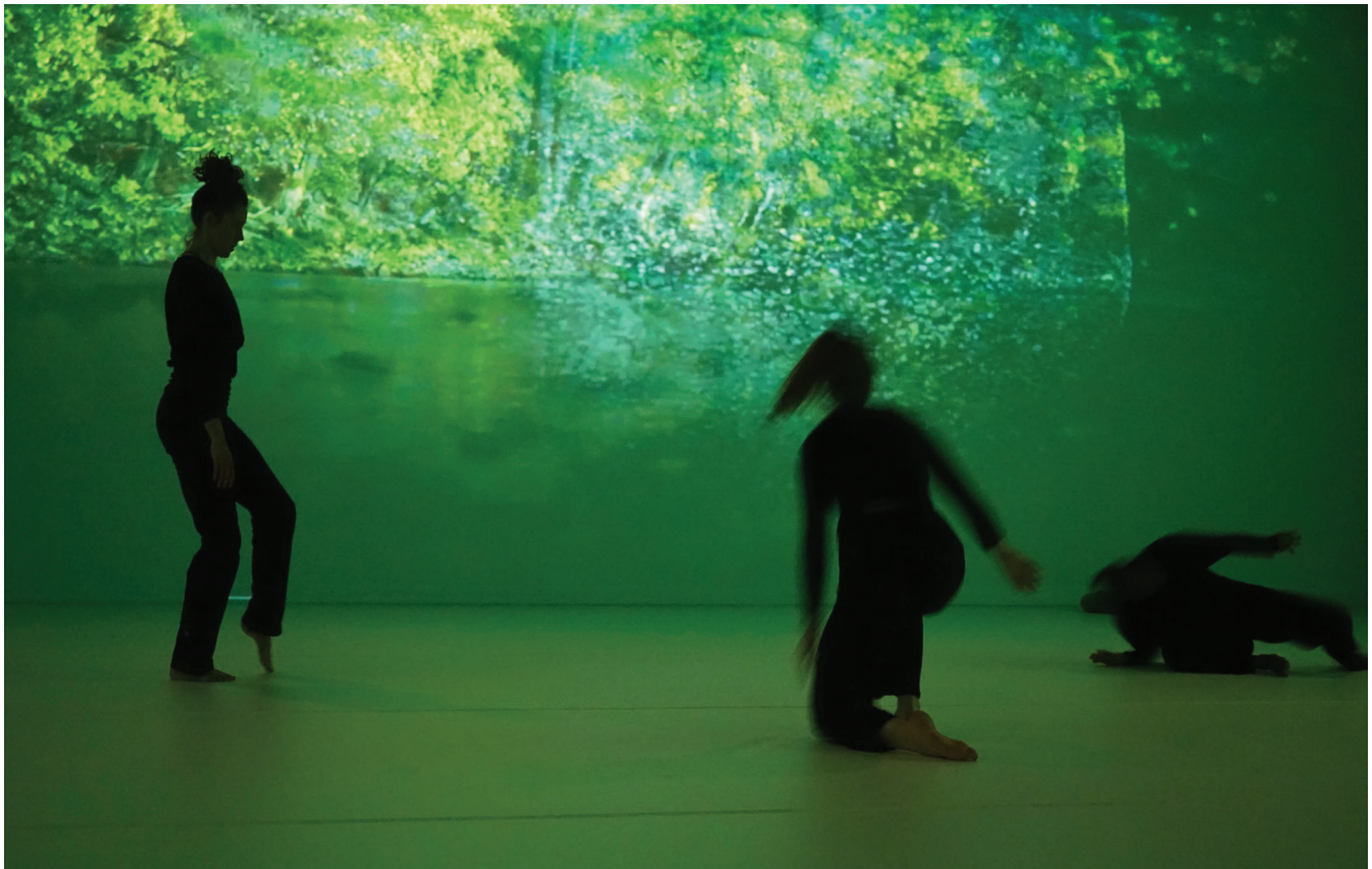
Figure 2. Photo showing the dancers concentrating on stepping, falling and the transferring weight

The inclusion criteria for participants in this study were to be 20 to 60 years old, fluent in French; the minimum age requirement was for legal informed consent. Participants had to have