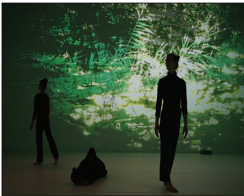
Figure 1. Photo showing the dancers against a backdrop of nature images.

The term “soundscape,” coined by the Canadian musician Murray Schafer (2010), refers to creating the sensation of being immersed in a particular acoustic environment through an audio recording. For example, musical compositions based on sounds captured in a real environment, with or without musical interpretation, can be considered soundscapes. This dramaturgic structure, in terms of both concept and music, is inspired by images found in the videos. All of the video images were filmed using very long and slow travelling shots and then reviewed to determine the juxtaposition of different sounds: birds, wind, waves, and lapping water. Marked by the ambulatory aspect of the choreography, the video images were created through embedding rather than superposition, which adds depth to the image and to the extreme slow motion of the sequences, with the transitions in the latter being imperceptible. The visual effect, which comes from chromatic changes made to the same landscape over different seasons, completes the creation, by pushing the slowness of transition between superposed images to the extreme; the result, at times, resembles Impressionist landscapes (e.g., John Constable (1776–1837) represented light on the foliage of trees using small, dispersed brush marks; Figure 1). The Dhrupad interpreters’ voice-