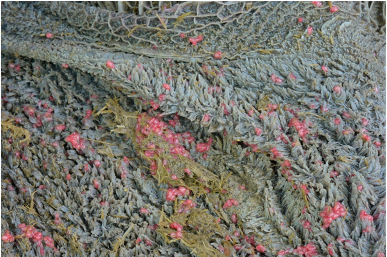
Figure 4. Adult RF in the reticulo-rumen of a bovine with burden score of 4.