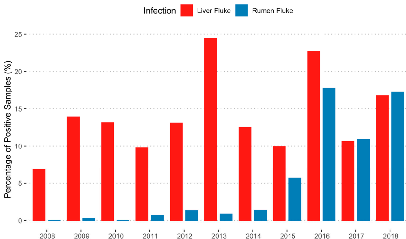
Figure 2. The percentage of faecal samples testing positive for rumen fluke eggs and liver fluke eggs during the study period (2008–2018).

Considering the total number of samples submitted ( n = 3068 ), diagnoses of rumen fluke increased yearly, with the highest percentage of positive RF diagnoses being recorded in 2016 ( n = 104/586 ; 17.8%). In 2017, the occurrence of RF infection fell to 10.9% ( n = 42/386 ), rising back in 2018 to 17.2% ( n = 36/209 ). There were two notable peaks in liver fluke diagnoses, one in 2013, when the proportion of liver fluke positive samples reached 24.4% ( n = 83/340 ), and another in 2016, reaching 22.7% ( n = 133/586 ). From 2017, the percentage of positive samples for RF exceeded that of liver fluke (Figure 2). There was no statistical difference in RF infection between bovine and ovine samples ( p = 0.20 ; \chi^2 = 1.66 ).