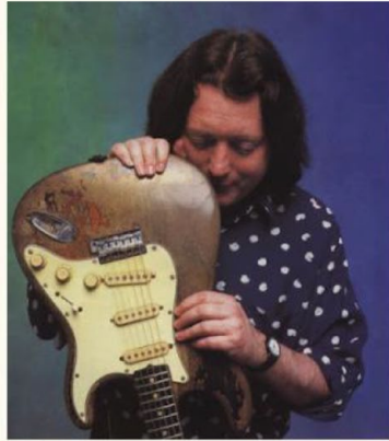
August 1991, Guitar for the Practising Musician

We would expect this sort of drivel from music journalists, keen to oversensationalise in order to increase readership, but we come across these types of comments on a daily basis on Rory fan groups, making us question how these people can seriously call themselves fans of the great man. Every time the official Rory Gallagher Facebook posts a photo of older Rory, we immediately feel ourselves tense, bracing for the inevitable barrage of disparaging comments about him. Over the years, we've seen everything from "pathetic" and "let himself go" to "shadow of his former self" and even "I only like looking at him when he was young and beautiful." So, at this early stage in our blog post, we already want to take pause to say how dare they? How fucking dare they?