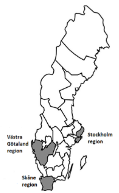
Figure 2: Location of the three study regions

gions studied here share important similarities; they all have growing populations with increasing numbers of foreign born inhabitants and the industrial structure is based on a variety of industries with a growing knowledge and service sector. We can thus assume a similar pattern of how openness is interpreted and discussed in the metropolitan regions of our study.