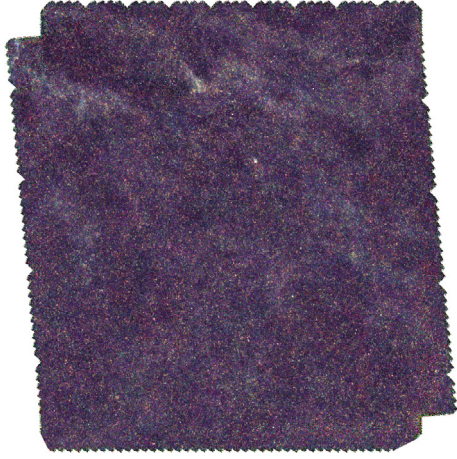
Fig. 1. False-colour image combining the SPIRE 250, 350 and 500 \mu\text{m} maps as blue, green and red respectively. The ragged edges show the individual scan-legs of the two scans. Galactic cirrus can be seen as patchy blue wisps over the field.

for each pixel the noise is scaled by N_{\text{passes}}^{1/2} , where N_{\text{passes}} is the number of detector passes. A false-colour image combining the SPIRE 250, 350 and 500 \mu\text{m} maps is shown in Fig. 1. The PACS H-ATLAS maps currently yield only a few hundred sources, which is insufficient for us to attempt a clustering measurement. The clustering in the PACS bands will be investigated in a future paper using more data.