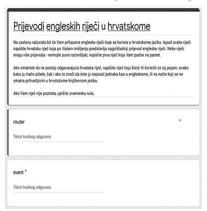
Figure 1. Example of the form used in the study<sup>1</sup>

The instructions and the examples are shown in Figure 1.