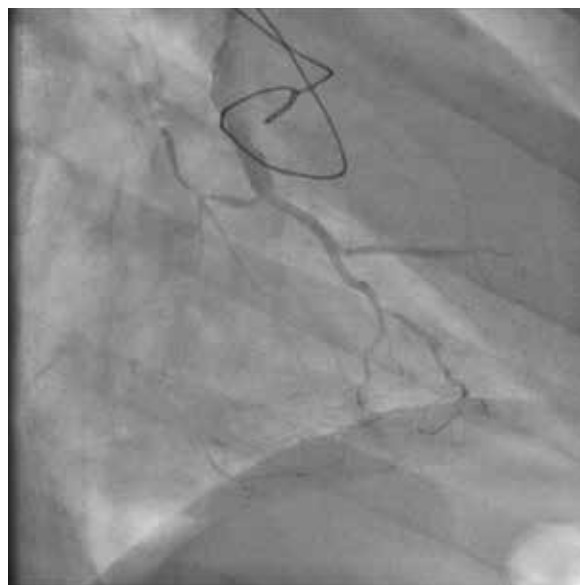
FIGURE 4. Coronarography performed on 3 months follow-up revealed no signs of restenosis with better flow distally.

Conclusion: Although covered stents and deferred stenting provide satisfactory acute results after primary PCI of VSM, their long-term results remain uncertain.