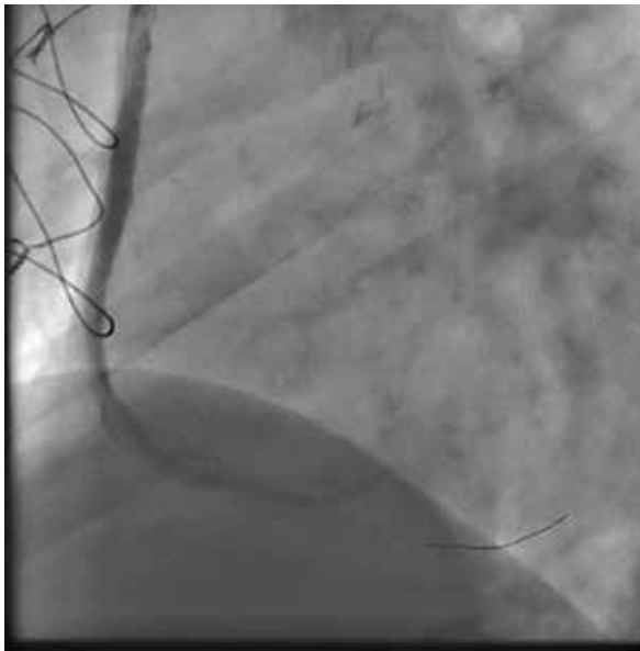
FIGURE 1. The final result after primary percutaneous coronary intervention of vena saphena magna coronary artery bypass graft thrombosis on right coronary artery treated with 3 covered stents (MGuard, all 3.5 mm) and 1 bare metal stent (5.0 mm). Post procedure thrombolysis in myocardial infarction flow 2 was achieved.

Case report: 68-year-old male with multiple cardiovascular risk factors, known coronary artery disease (CAD) treated with PCI on left anterior descending artery (LAD) in 2007. and two VSM coronary-artery bypass grafts (CABG) on right coronary artery (RCA) and left circumflex artery (LCX) in 2008. has presented with inferior ST elevation myocardial infarction (STEMI) in 2016 due to thrombotic occlusion of VSM on RCA. Despite multiple successful thrombectomies, three covered stents (MGuard, all 3.5 mm) had to be implanted. Additionally, one 5.0 mm bare metal stent (BMS) has been implanted in severe stenosis proximal to the occlusion. During the entire intervention, two boluses of eptifibatid were given, with the final thrombolysis in myocardial infarction (TIMI 2)