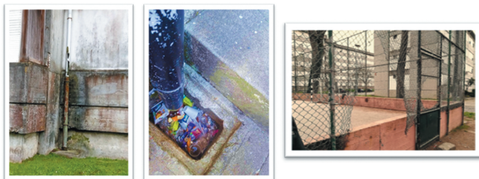
Figure 3. Deteriorated buildings, the school gutter clogged with garbage, and damaged sports space.