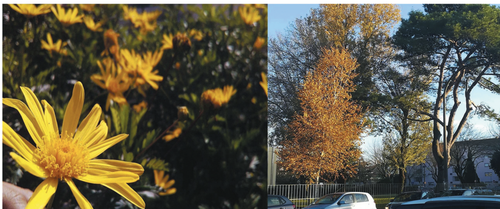
Figure 2. Green spaces and public gardens in the vicinity of their neighborhoods and school appreciated by the group.