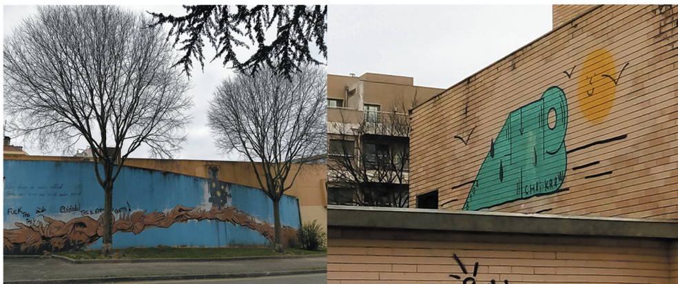
Figure 1. Mural at the entrance of one of the neighborhoods and a wall painting on the front of a building.