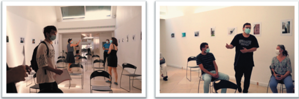
Figure 4. The group in the exhibition of their photographs and in the discussion with local policy-decision-makers (July 2021).