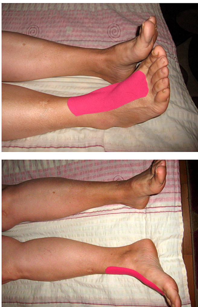
Fig. 1. Application form "I" shape was applied in the area of the foot.

The tests were carried out during the hospitalization and discharge of the patients. The prism 3.0 statistical package was used to analyze the obtained results. The data were compared with the data of the patients of the