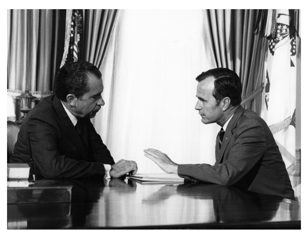
George H. W. Bush, chairman of the Republican National Committee (1973–74), meets with President Nixon in the Oval Office.

the Republican nomination if offered, but would remain an Independent, welcoming the support of Democrats, Independents, and Republicans.<sup>31</sup>