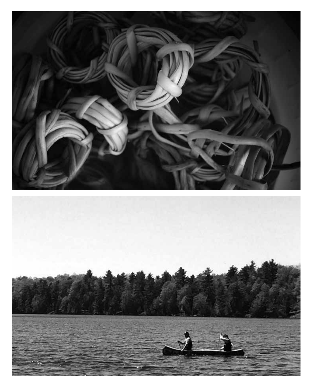
FIGURE 5.4. Spruce root (wadab), peeled and prepared for use in a birchbark canoe build.

FIGURE 5.5. Chuck Commanda and his apprentice paddling a canoe built at Murphy's Point Provincial Park in the summer of 2018.