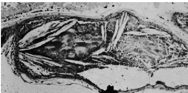
Figure 2. An embolus of atherosclerotic debris in a cerebral blood vessel. Emboli of atheroembolic debris laden with cholesterol crystals (the pointed slender white structures seen in this image) are not prevented by antiplatelet agents; they are prevented by endarterectomy. Stents with a fine mesh might prevent many such emboli, but open stents will not. Intensive medical therapy reduces microemboli detected on transcranial Doppler in patients with asymptomatic carotid stenosis.

The recent guidelines of the American Heart Association 14 and other organizations suggest that the indications for CAS be extended to include low-risk patients. This may make a bad situation worse by opening the flood gates for increased use of CAS in patients with ACS when most of these patients are best treated with intensive medical therapy. The value of Hirt's report is that it describes a way to select ACS patients at higher risk for stroke so that they can be treated invasively and the