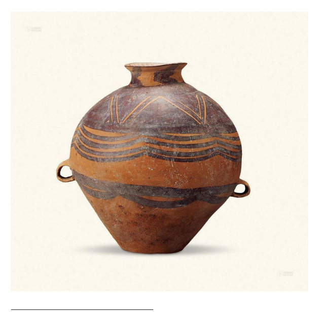
painted pottery of Yangshao Culture

changing on the physical, technical, institutional or ideological level. Chinese culture in essence has been evolving and developing in constant fusion and the people and area it covered have been enlarged, and the cultural connotation is changing in the process of exchange and fusion.