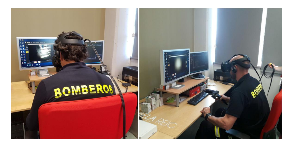
Figure 2. Firefighter tests.