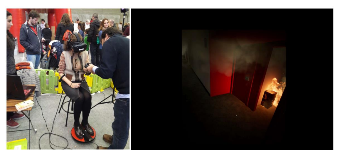
Figure 1. User experience and virtual environment.

Figure 1 shows a user experience and the virtual environment. Figure 2 shows the firefighter testers who certified the realism of the fire in the virtual environment.