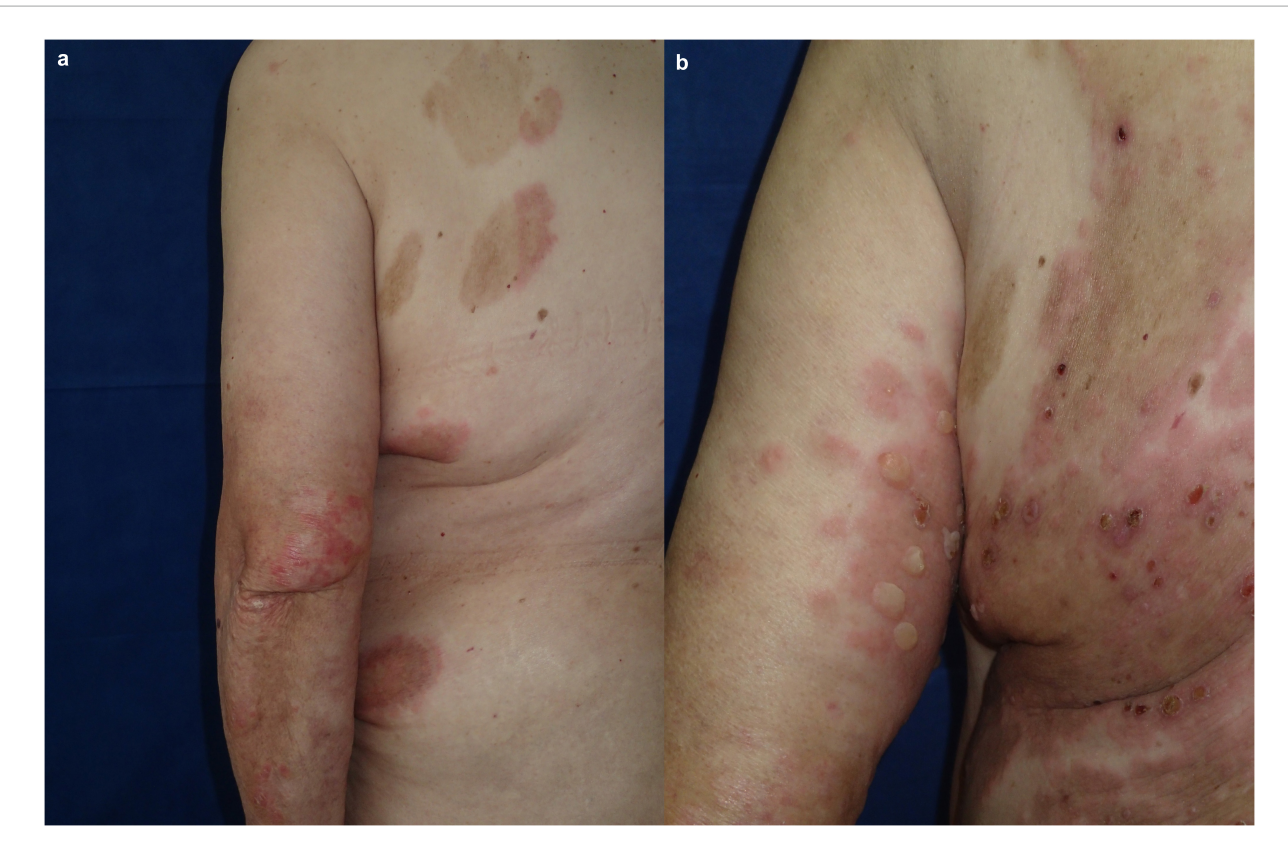
FIGURE 2 Clinical presentation of patient 2: (a) Flare of both psoriasis and BP while on reduced dose of methotrexate; (b) worsening of BP during secukinumab treatment.