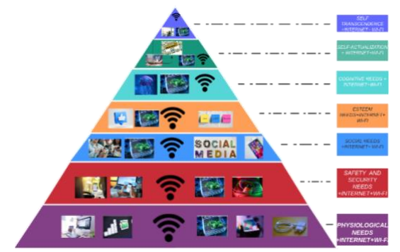
Fig 2: Modified Maslow's H. of Digital Needs (3.0)