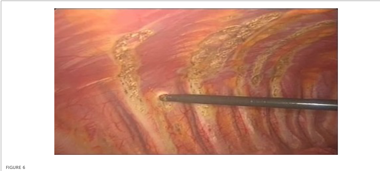
VATS mechanical pleurodesis with electrocautery on the parietal pleura to minimize the risk of CP recurrence. VATS, video-assisted thoracic surgery; CP, catamenial pneumothorax.

with the menstrual cycle and meticulous inspection of the thorax, including the diaphragm, are important factors that need to be considered.