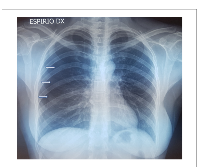
\begin{array}{l} \mbox{FIGURE 1} \\ \mbox{Chest x-ray showing CP on the right side: white arrows indicate the collapsed lung. CP, catamenial pneumothorax. \end{array}

No postoperative complications occurred. Pathological diagnosis of endometriosis on the resected diaphragm was achieved in five patients (62.5%).