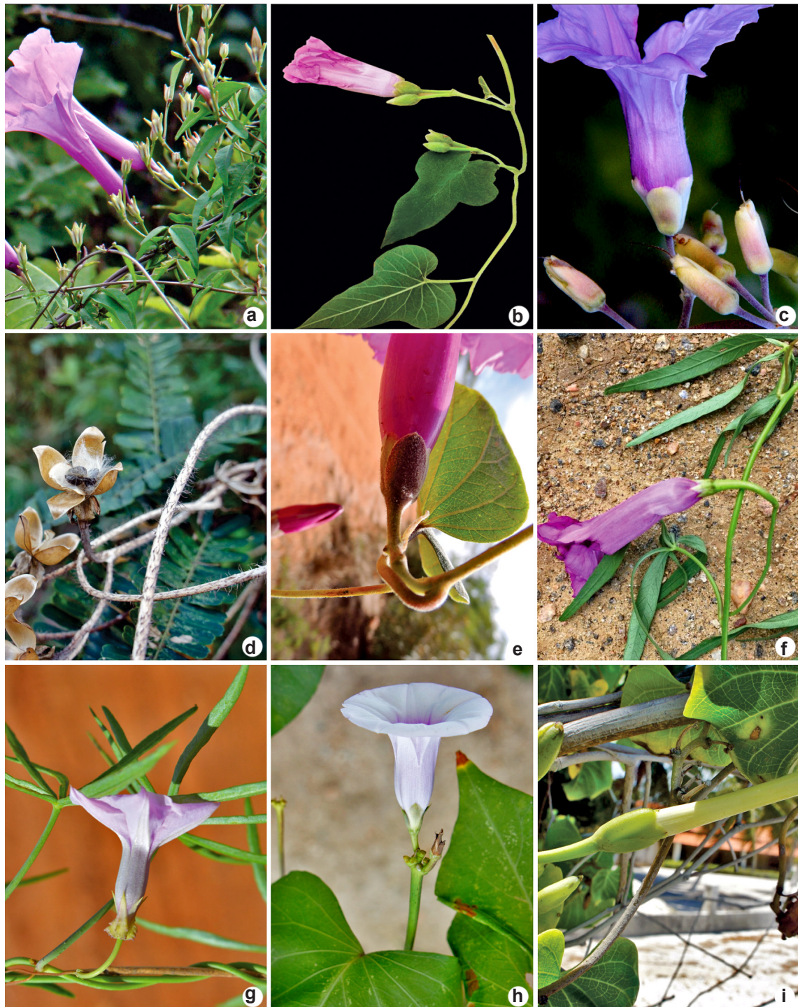
Figure 5 – a. Ipomoea rosea - sepals with tooth-like appendages. b. Ipomoea rubens – corolla. c. Ipomoea sericosepala – flower. d. Ipomoea setosa – dried fruit and stems with blackish hairs. e. Ipomoea brasiliana var. subincana – sepals. f. Ipomoea subrevoluta – corolla. g. Ipomoea tenera – flower. h. Ipomoea tiliacea – flower. i. Ipomoea violacea - rounded sepals.