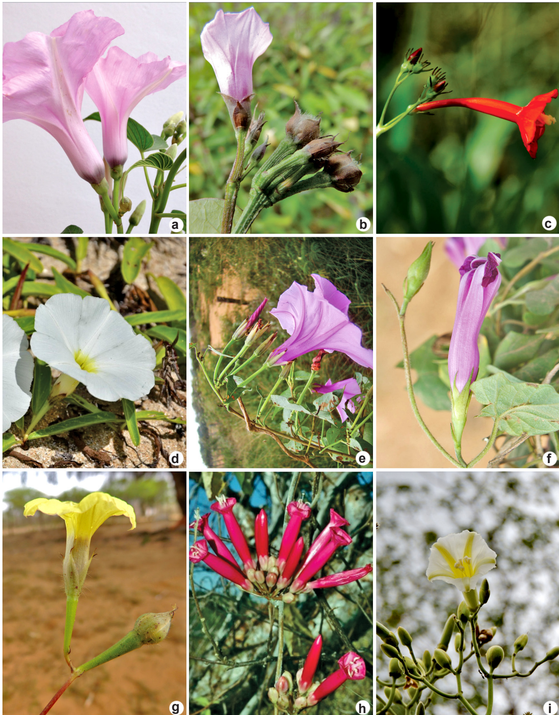
Figure 3 – a. Ipomoea carnea subsp. fistulosa – corolla. b. Ipomoea grandifolia – corolla small and sepals ciliate. c. Ipomoea hederifolia – outer sepals with awn. d. Ipomoea imperati – corolla. e. Ipomoea incarnata – corolla. f. Ipomoea indica – corolla and sepals. g. Ipomoea longeramosa – corolla. h. Ipomoea longistaminea – corolla bright with rotund and glabrous sepals. i. Ipomoea marcellia – corolla.