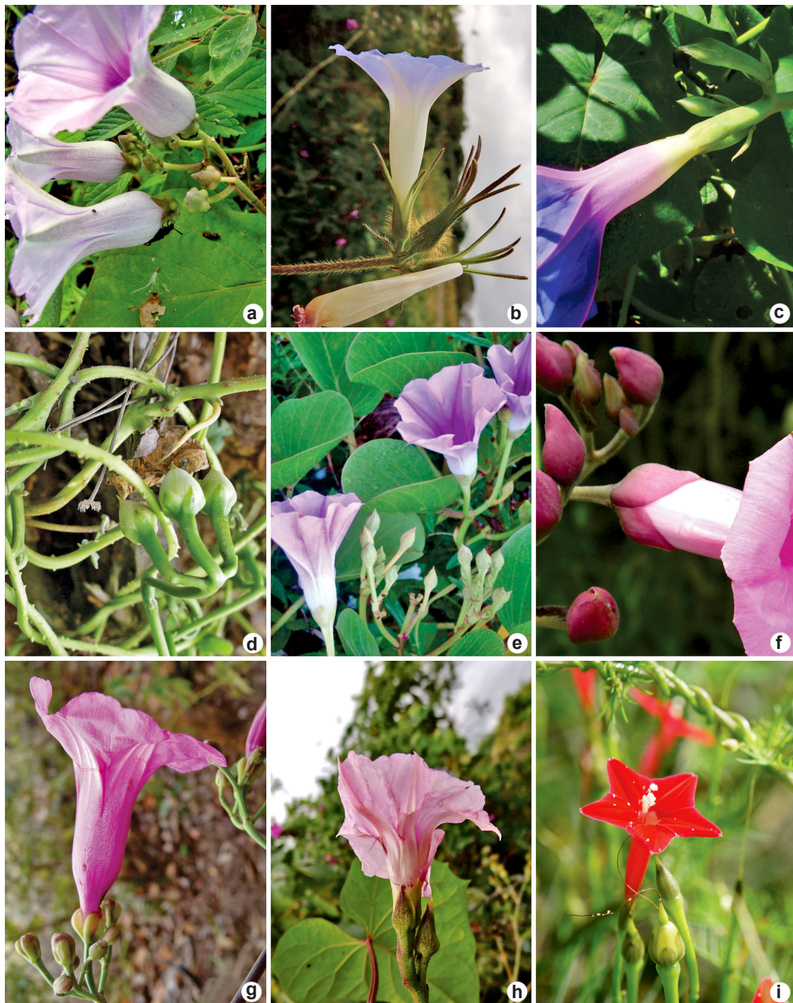
Figure 4 – a. Ipomoea megapotamica – corolla and sepals with gibbous base. b. Ipomoea nil – corolla and sepals with a long and linear acumen. c-d. Ipomoea parasitica – c. flower; d. stems with fleshy spines and fruits. e. Ipomoea pes-caprae – corolla. f. Ipomoea philomega – sepals. g. Ipomoea pintoii – corolla. h. Ipomoea acanthocarpa – flower. i. Ipomoea quamoclit – flower. Photos: LASI.