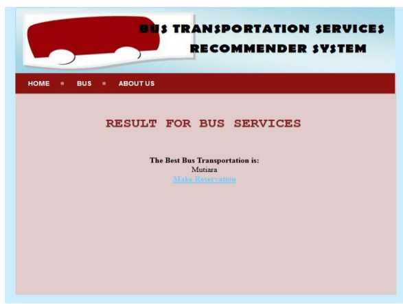
Figure 3: Result page

After that, a result is displayed where the best bus transportation service recommended by the system (calculated by using TOPSIS method) is shown as in Figure 3.