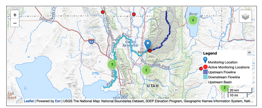
Fig. 1. Location of the gauge station (USGS)

A discharge data set of the stream was downloaded from USGS (United States Geological Survey) website. The data set is starting in 1971 and it is ending in 2020 (including). The data set was chosen as mean monthly statistics. The data set is belonging to the Logan River Above State Dam, Near Logan, UT gauge station. The station number is 10109000. The location of the stream and the gauge station is given in figure 1.