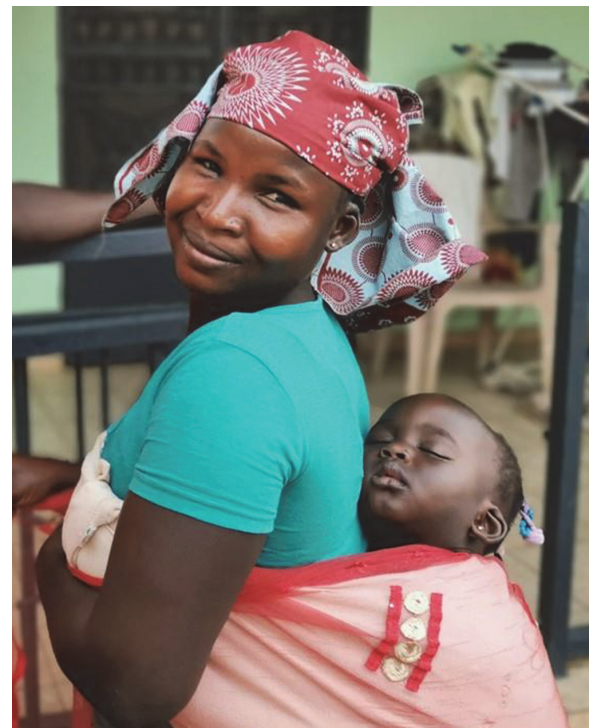
Abstract 2022-RA-601-ESGO Figure 1

Results Convering screening of cervical cancer in the course of the mention, 3,71% (119) of smear cervical test out a total of 3205, have submitted an outcome precancerous lesions. It is worth mentioning that 2 of the 3 campaigns carried out included surgical interventions to avoid progression to cancer requested at least 81,54% of women with abnormal outcomes. Additionally, 66,93% of women screened had performed HIV test, resulting 11,27% positives. The cited percentage could be even higher if all the women had run the test.