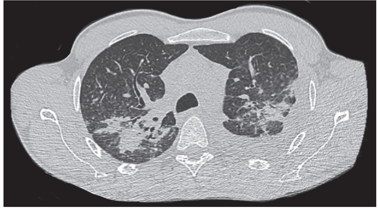
Figure 3 – Thoracic computed tomography of the chest in June 2019