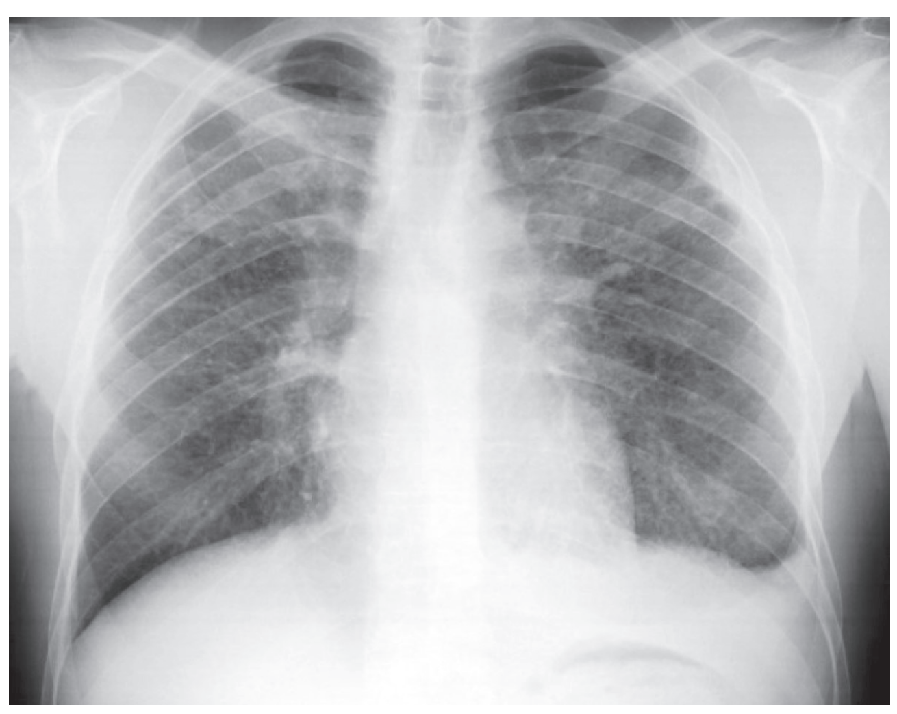
Figure 2 – Admission's chest radiography