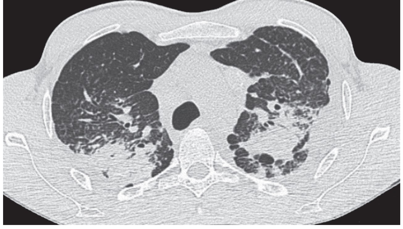
Figure 4 – Thoracic computed tomography of the chest in August 2020 showing worsening of the fibrotic masses

The authors declare that the procedures were followed according to the regulations established by the Clinical