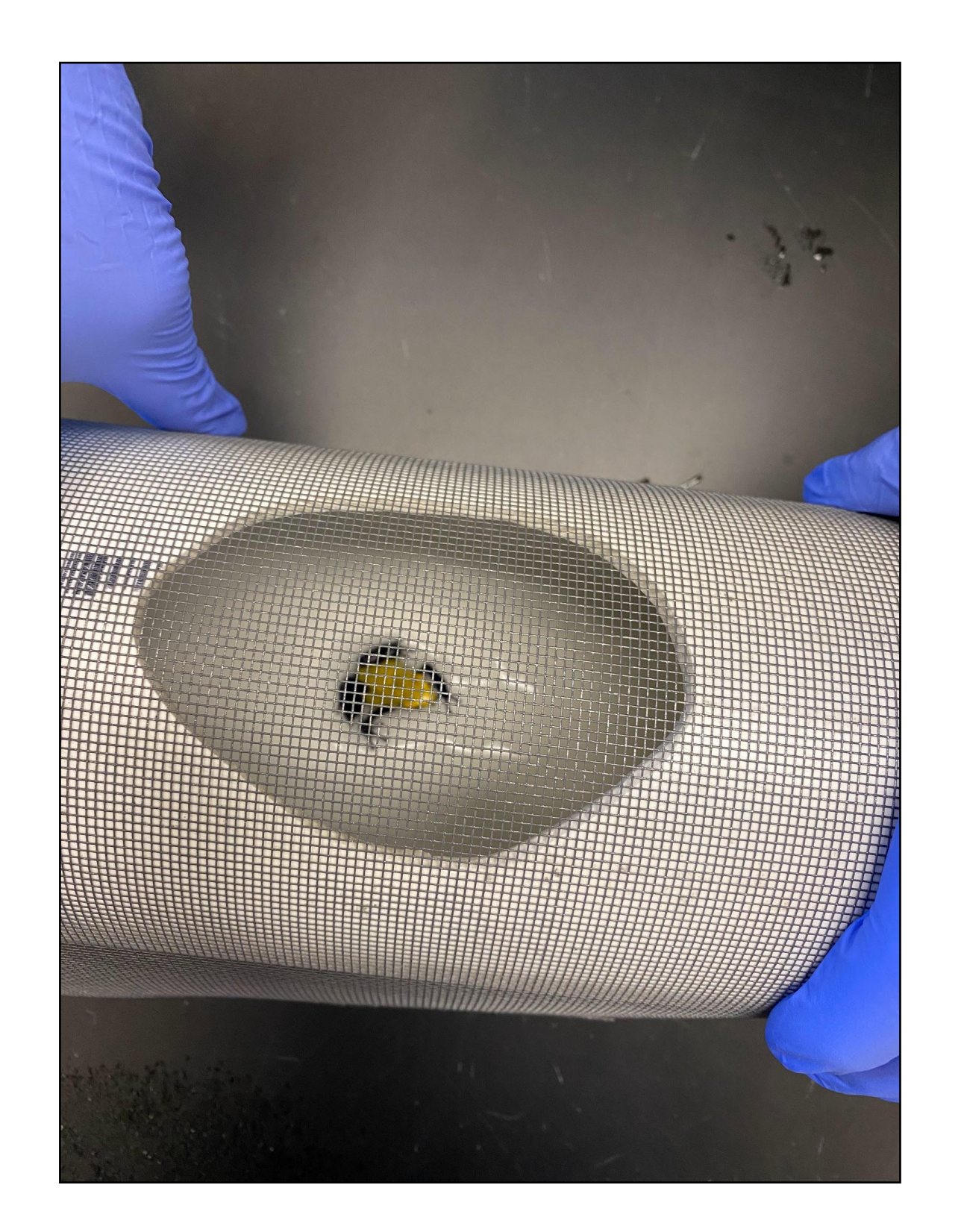
Image 1: D. tinctorius placed in the center of the pipe. A fine wire mesh was placed over the opening to prevent the frog from jumping out.