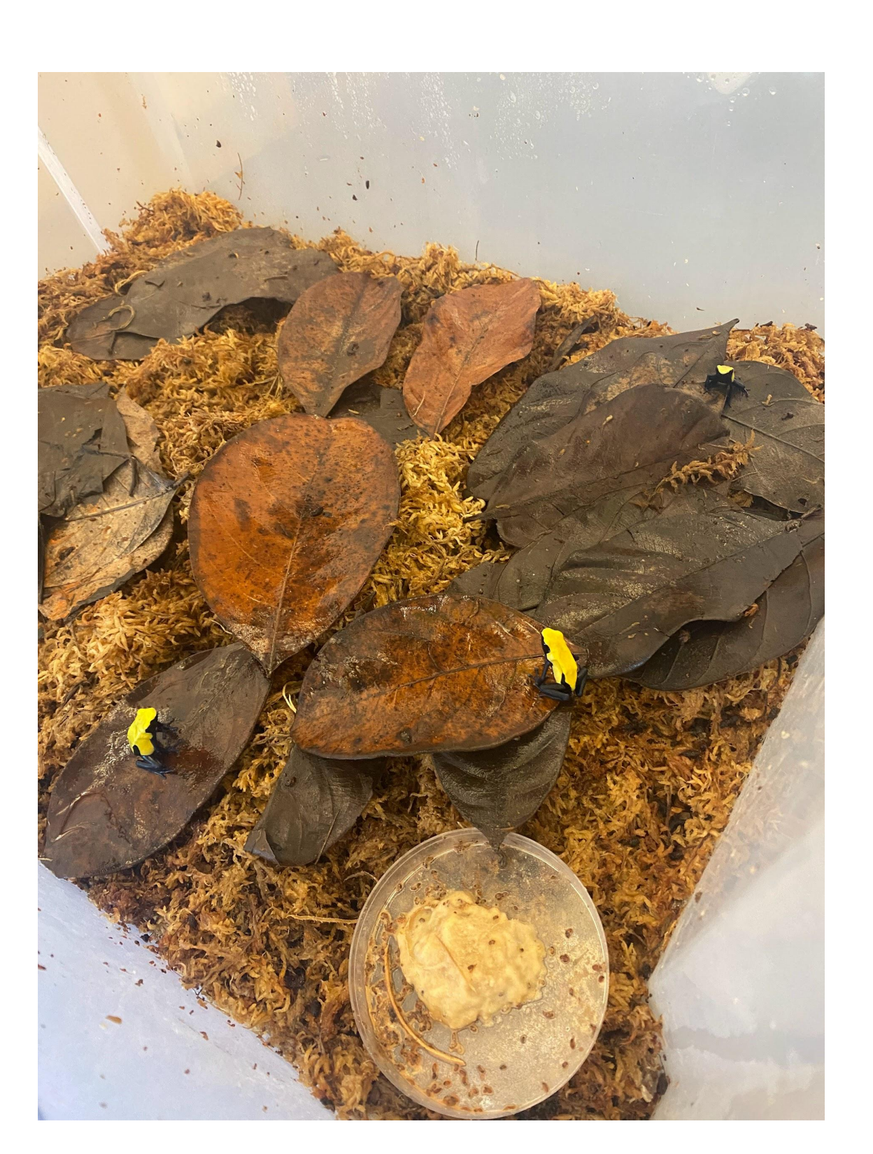
Image 3: There were three separate D . tinctorius enclosures. After each trial, the frogs were placed back in their respective enclosures.

Figure 3: This table shows the count of the experimental groups for P . cadaverina and D. tinctorius. The behavior of the frogs was split into no movement and far movement, where far movement was the sum of the count of frog that was ranked a 1 or a 5. A chi-square test was run to determine that there is a significant difference between the two species of frogs reaction to an agitated P. regilla disturbance cue (p=.0137).