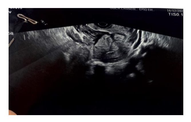
Figure 1: USG findings at our institute showing breach in anterior myometrium and lower uterine segment with scar site hematoma suggestive of possible rupture.

Pffanensteil incision along the previous scar. Intraoperatively, scar site ectopic was present on right side of previous caesarean scar, which was actively bleeding (Figure 2).