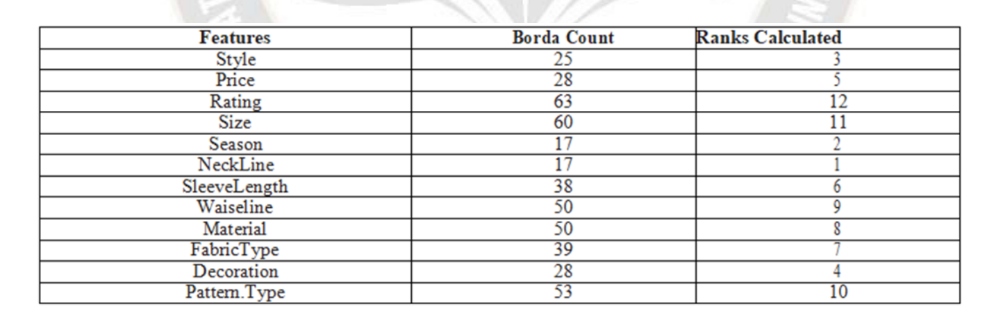
Table 7: Borda Count Results

The top-k searches on large multidimensional datasets are expensive to evaluate, and the BC cannot handle multivalued objects with inconsistent cardinality [27]. To employ the BC approach, it is first necessary to compute the multiple feature rankings that are produced from separate feature selection procedures. That is the objective of Table 2. Table 7 presents the ranks calculated using the BC technique.