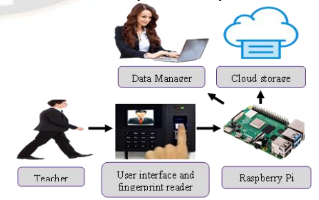
Fig. 1 System block diagram

In this part of the methodology, the block diagram of the proposed system will be conducted, as shown in Figure 1, detailing each stage that makes up the system and considering important aspects so that the system takes the assistance in an abbreviated time, accurately and efficiently.