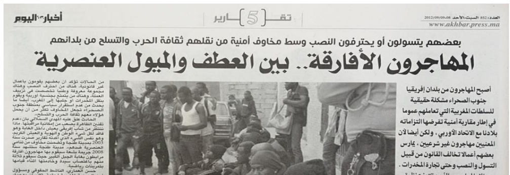
Figure 4. African immigrants ... between sympathy and racist tendencies ( Akhbar Alyaoum , Sep 8 and 9 th , 2012, N 852)