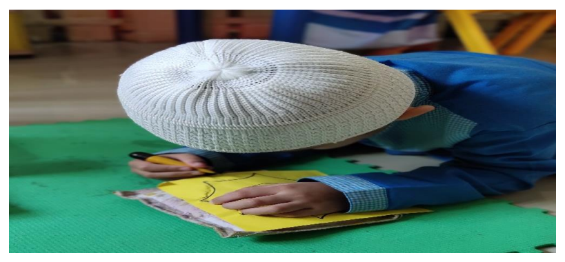
Figure 4. The students are doing the task of punching papers

c. Assignment, is one of assessment technique that giving tasks to students within a certain time, either individually or in groups, independently or accompanied.