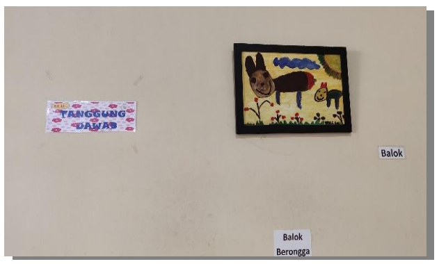
Figure 2. Value of Responsibility at Beam Center