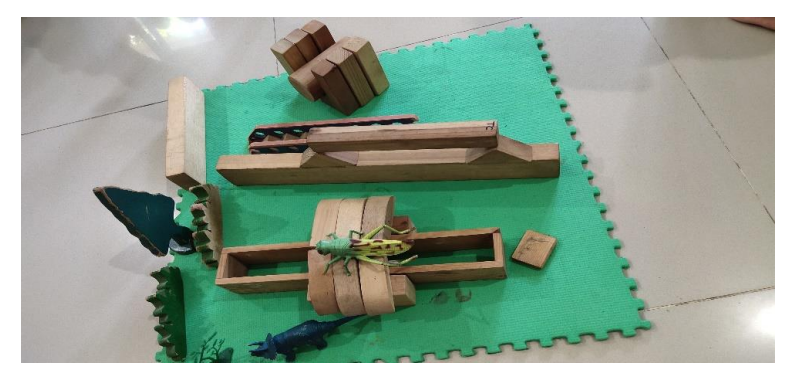
Figure 6. Students' work

e. Product This technique sees and evaluates the products that produced by children, in the form of real works and can be in the form of handwork, performances or children's artwork.