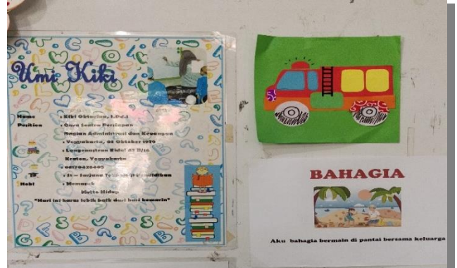
Figure 1. Value of happiness at the Preparation Center

a. In the preparation center there is a happiness value. So that, early childhoods learn about alphabet and number by happiness. They know how to learn by happiness and why they have to be happy to learn.