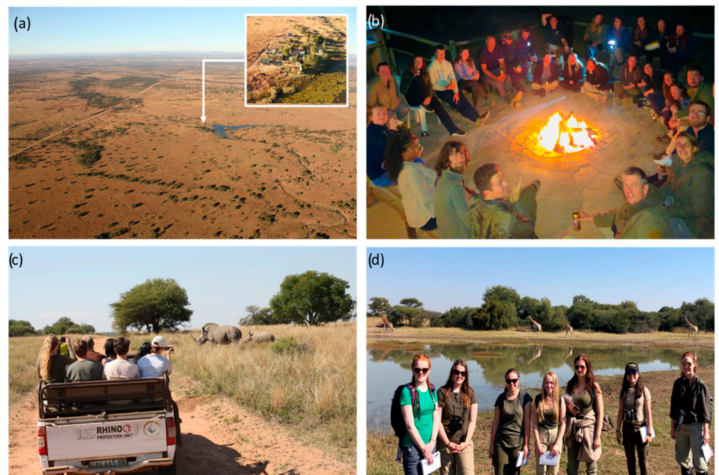
Figure 1. The focal wildlife reserve, South Africa, showing: (a) an aerial view of the Reserve, with an inset showing the camp where participants stay; (b) campfire social event; (c) driven mammal transect with white rhino Ceratotherium simum (right of image); and (d) walked mammal transect with four giraffe Giraffa giraffa (background).

The focal site was a 47 km 2 wildlife reserve in Northwest Province, South Africa. The reserve is set within a savanna landscape of grassland and scrub that supports >40 species of large mammal and >350 species of birds. The reserve has hosted educational groups for 25 years in a camp in the middle of the site (Figure 1a). Groups either comprised students from a university or college studying ecology (henceforth termed a formal educational group) or people attending a volunteer expedition run by the Earthwatch Institute (henceforth termed a special interest group). Earthwatch has run trips to the Reserve for over 20 years and works with people who, while not enrolled on a formal educational programme, want to learn about wildlife management and engage with hands-on conservation internationally and in real-world contexts.