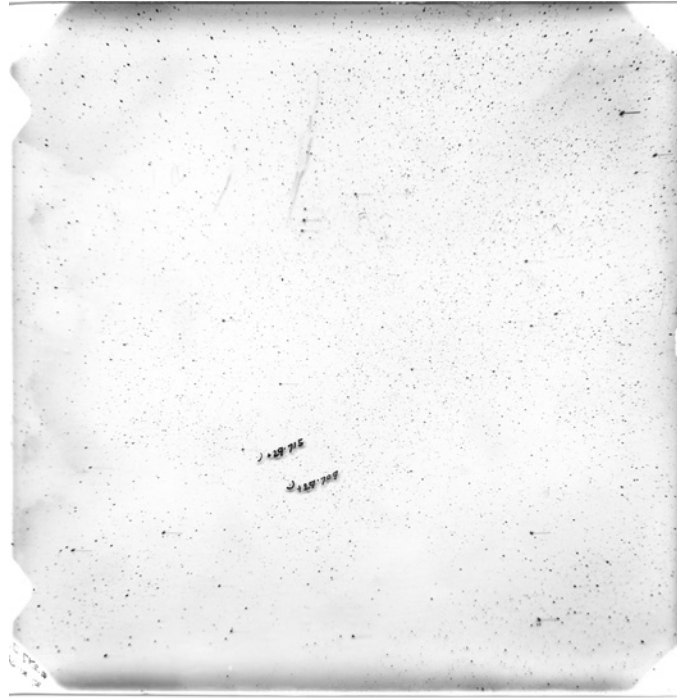
Fig. 4 Scanned photographic plate (from the very early datasets)

EURO-VO provides some tools, which are going to be used together with the standard software (SQL, JAVA, Perl etc.) to build an appropriate database. We expect to generate around five Tbyte of data in the first instance. Handling will be achieved using the Linux Software RAID array with Linux Volume Manager.