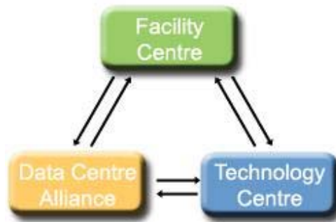
Fig.2 Organization of European Virtual Observatory

EuroVO is organized in three main parts as shown in Fig 2.