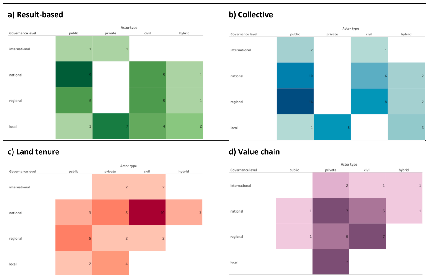
Fig. 2. Comparison of involved actors per societal sphere and governance levels across contract types.

For the single roles the following observations can be made: