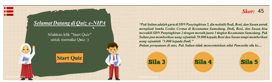
Figure 2. Display of The Menus in e-NIPA Application

DOI: http://dx.doi.org/10.33578/jpfkip.v12i1.9442 https://primary.ejournal.unri.ac.id/index.php/JPFKIP