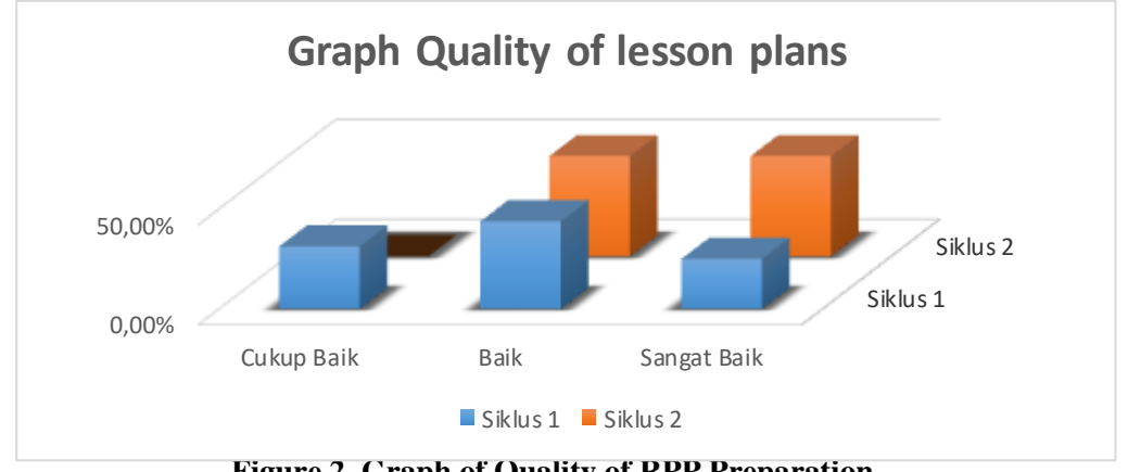
Figure 2. Graph of Quality of RPP Preparation

https://primary.ejournal.unri.ac.id/index.php/JPFKIP