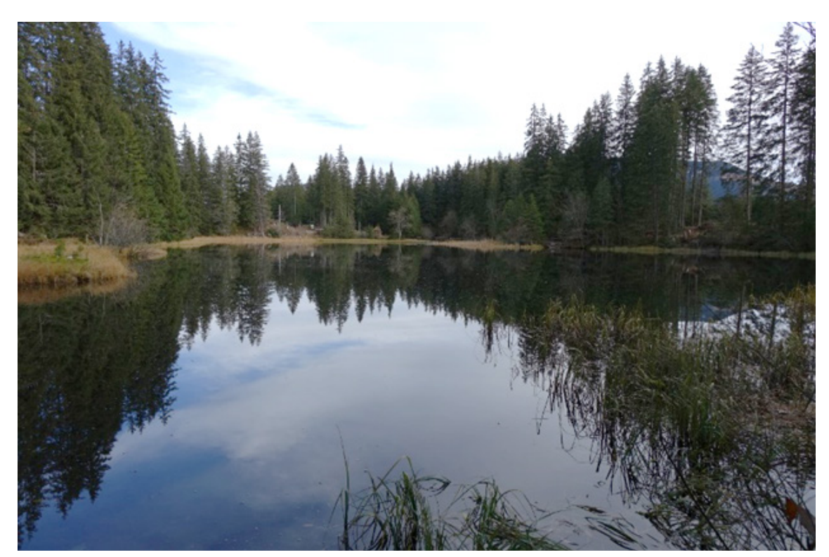
Figure 1. View of lake Vrbické pleso.