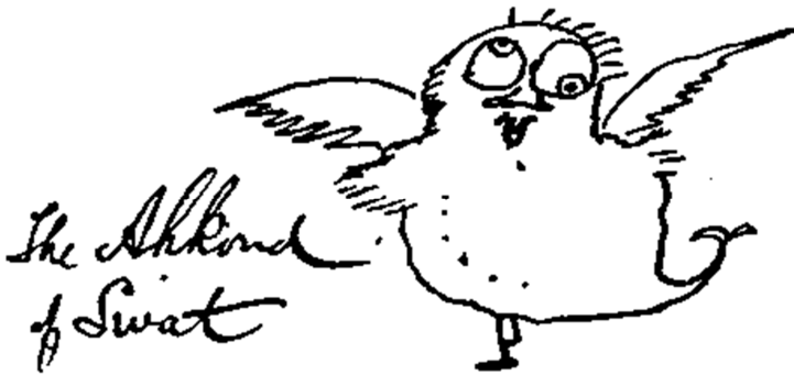
Figure 1: An illustration of Akond of Swat included in Edward Lear's letter to Lady Waldegrave (Strachey 1911: 168).

Interestingly, these interpretations allude – perhaps unintentionally – to idea entertained by the author himself (Figure 1), who, in a private letter to Lady Waldegrave of 25 October 1873, expressed his delight at the poem's popularity and depicted his “potentate” as a clumsy hybrid of a sparrow, fish and man, signed with an orthographically incorrect variant of the title (Strachey 1911: 168):