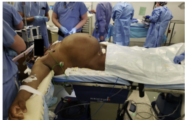
Fig 1. Patient 7 immediately after drapes were removed, showing significant abdominal distention from fluid extravasation. General surgery was immediately consulted.

However, hip arthroscopy may not be familiar to as many surgeons as standard open techniques. 3 Complications of hip arthroscopy include iatrogenic articular injury, pudendal nerve injuries, typically if traction exceeds 2 hours and if there is inadequate padding of the perineal region, and the potential for abdominal compartment syndrome, seen with intra-articular fluid