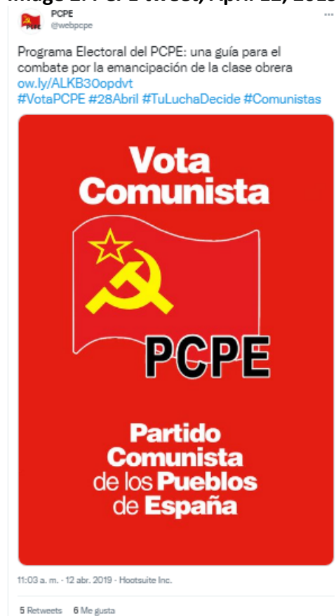
Image 2. PCPE tweet, April 12, 2019.

illustrates this, with its explicit asking for vote and traditional communist propaganda style). On the other extreme of the political spectrum, VOX's tweets calling for votes did not reach 2%. Moreover, the parties' disinterest in signing up volunteers, subscribing to online communication tools, and raising funds for the campaign, is also remarkable.