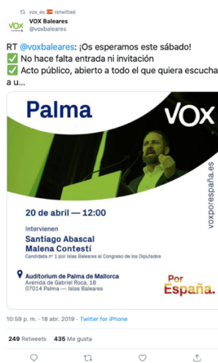
Image 1. VOX tweet, April 18, 2019.

Predominating mobilization tweets may be exemplified by the following VOX message, calling the Spanish people to a party rally in Palma de Majorca: