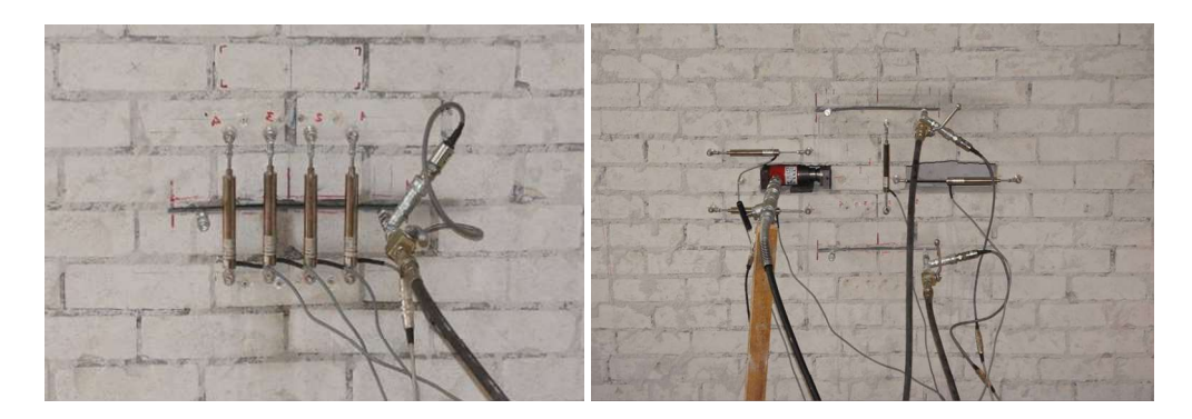
Figure 4. Single flat jack test (left), shove test (right)

While the laboratory tests are in general more accurate and complete, the in-situ campaign is typically cheaper, faster and much less disruptive. Furthermore, testing in-situ adds the unknowns of a not completely controlled environment, but eliminates the non negligible effects of the samples cutting and transportation, and allows the testing of very poor quality masonry which would be impossible to be brought to the laboratory.