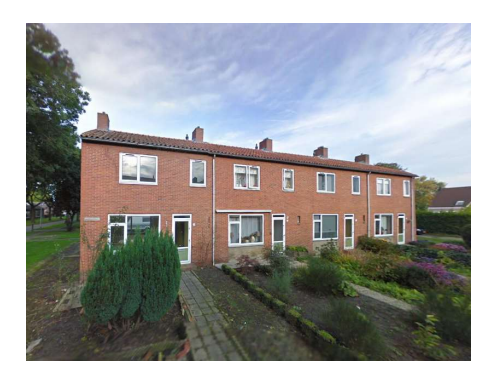
Figure 2. One of the tested buildings, typical terraced house of the Groningen region

In order to obtain meaningful results, it was decided that a minimum of four buildings per masonry category should be tested. Following the philosophy of maximizing the usefulness of the performed tests, the new test buildings were chosen among those which will be used in more than one sector of the project (see Figure 2). In particular buildings which will be upgraded and buildings to be demolished.