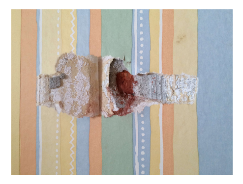
Figure 1. Inspection of wall for material determination