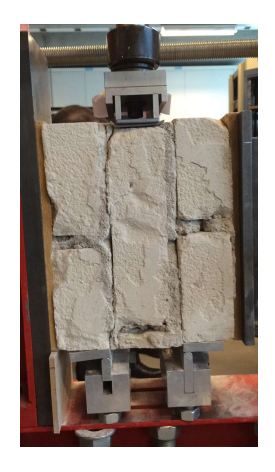
Figure 3. Laboratory shear test on calcium silicate masonry

As a consequence of the limited number of tested samples (see Section 2.3), no statistical distribution for the mechanical parameters could be derived and only the average value, the coefficient of variation and the minimum and maximum value measured during the campaign were proposed as results. The mechanical parameters were considered as uniformly distributed between the provided minimum and maximum value. An example of the results can be seen in Table 3, in specific the compression strength of clay brick masonry.