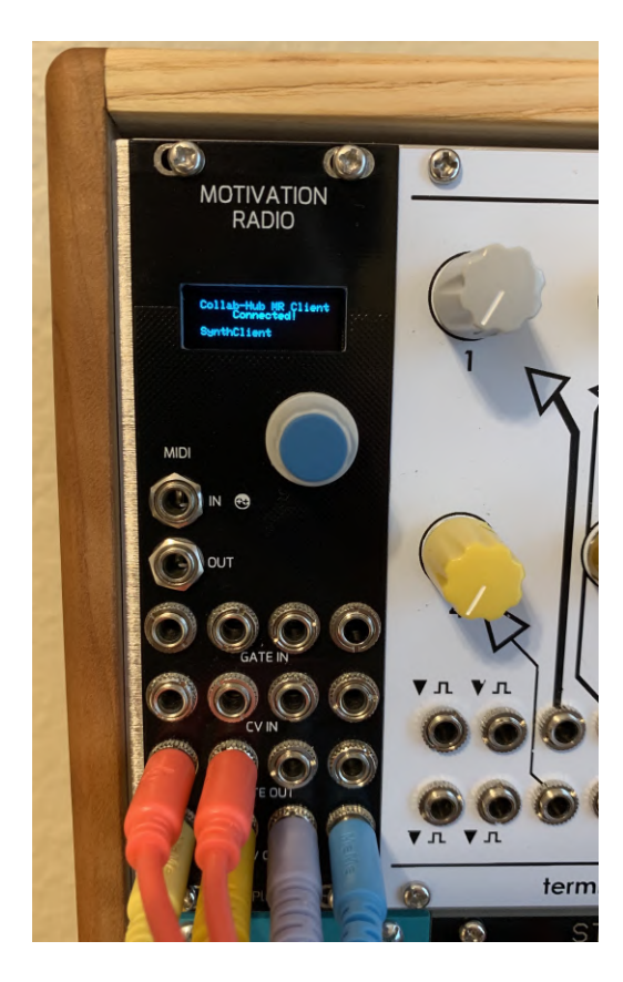
Figure 4: The Motivation Radio Eurorack module connected to the Collab-Hub server.