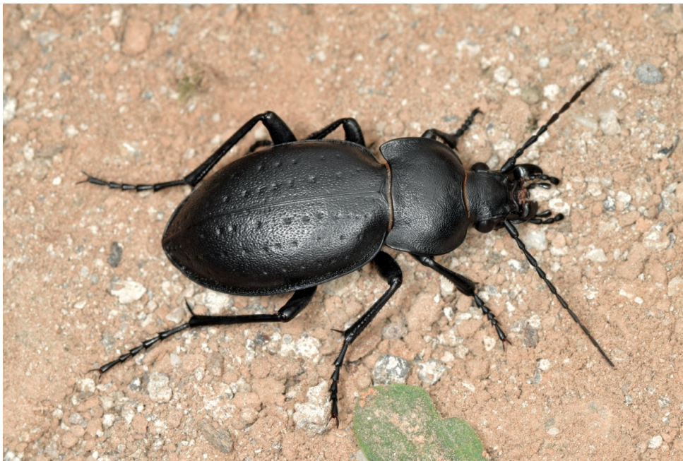
Figure 1. A female of Carabus hungaricus from the vicinity of Alibunar, a town on the northern edge of the Deliblato Sands (photo by: N. Vesović).

Carabus hungaricus is an autumn breeder with winter larvae and overwintering adults. The longest life span observed in a capture-recapture experiment was five years for a female. The beetle's main activity period is in the autumn (mid-September to mid-October) when it reproduces. It has another, smaller peak of activity in the first half of June, when tenerals emerge (Bérces & Elek, 2013).