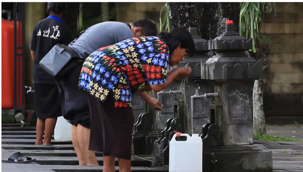
Picture 6: the pilgrims wash their faces, hands, and feet and fill their plastic jars from the nine faucets beside the SHJT see https://www.youtube.com/watch?v=ijn9d8c4fxU