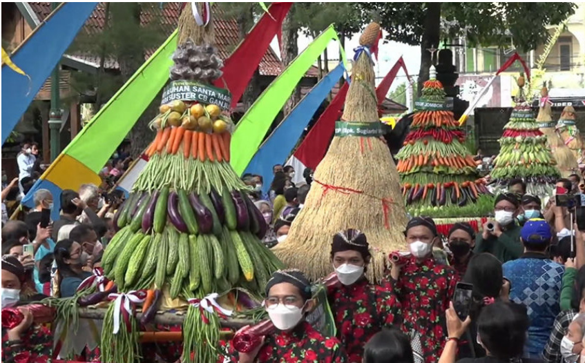
Picture 9: Javanese Tradional Offering in the form of Farmers’Crops on Sunday June 26, 2022, Mass of the Solemnity of the Sacred Heart of Jesus 39

The celebration of the Solemnity of the Sacred Heart of Jesus in the last week of June is the climax of any celebration in the SHJT. This celebration is very special and perfectly displays the Javanese tradition of inculturation in terms of dress, dance, music, procession of the Blessed Sacrament, and offerings that resemble garebeg or the carnival in Javanese palace (figure 9).