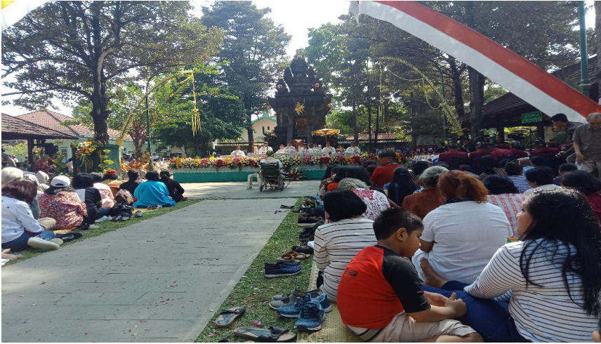
Picture 10: The Faithful sitting on the ground in athe Solemnity of the Sacred Heart of Jesus, June 30, 2019; the SHJT as the center of the liturgy.