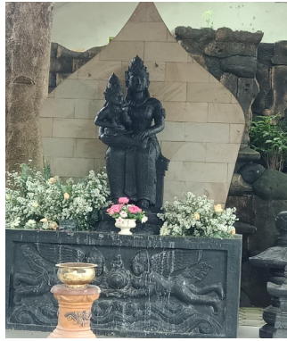
Picture 4: The picture of Mother Mary as Javanese woman holding the baby, Jesus

church appeared in the Jewish church, then Christianity moved to the city of Antioch and became the Greek church, then spread to Rome and became the Roman church. But why come to Java remains a Dutch church.” 33 Vatican gave them permission but only partially. The church building still has a European style, but the interior has a Javanese style, including a statue of Jesus and Mother Mary (see picture 4)