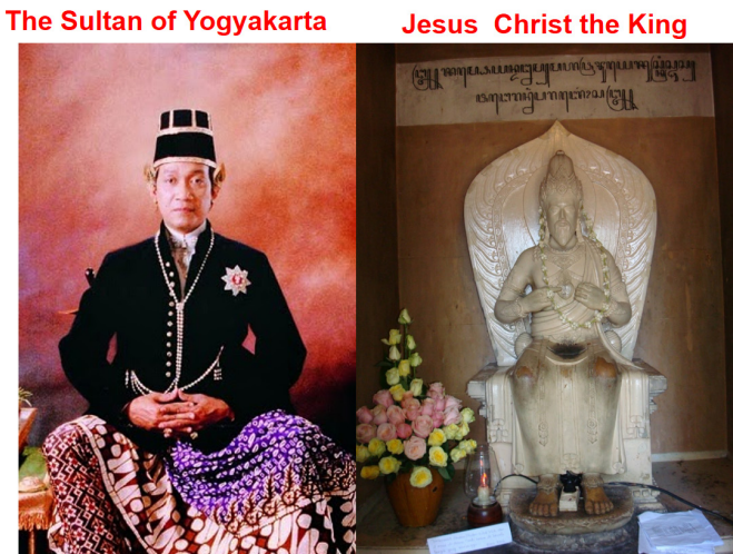
Picture 3: The Picture of Sultan of Yogyakarta and the Statue of Jesus in SHJT