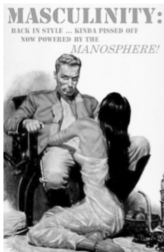
Figure 1. The Manosphere. 33

liberation) across much Right-populism. In alt-Right and white nationalist circles, in particular—from 4Chan, to ‘gamergate’, to pick-up artistry and the resentments of Incels, to an unleashed violent pornographic trolling culture of rape and death threats—we glimpse an emergent online cultural form: the so-called ‘manosphere’ (see Figure 1). Opposed to the feminising and ‘gaying’ of national cultures (condensed in the disdainful deployment of the term ‘snowflake’), revelling in the circulation of pornographically violent images and virtual gaming imaginaries of battle, and a ‘passion for the real’. 32