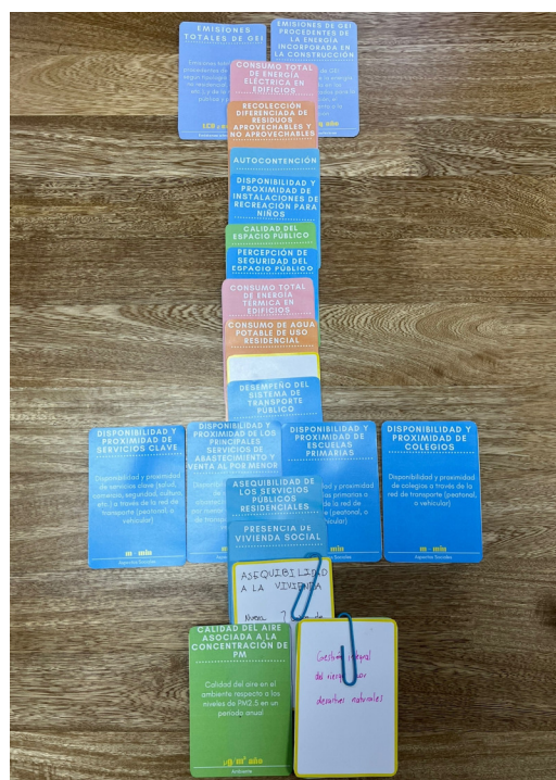
Figure 3. Ranking of indicators according to the SRF method—workshop Part 2.

placed four indicators on the fifth level with the same importance and they decided to use one white card between the tenth and eleventh position of the ranking. Finally, they also decided to place the same importance on the last two indicators (positions 19 and 20). With this in mind, the column “Position” in Table 6 shows the place (from the most to the less important) of each indicator after the application of the playing cards. The rows with more than one value represent indicators that were placed with the same importance in the ranking, such as Ambient air quality concerning PM2.5 over one year and Natural disasters risk management sharing the position of the most important indicator.